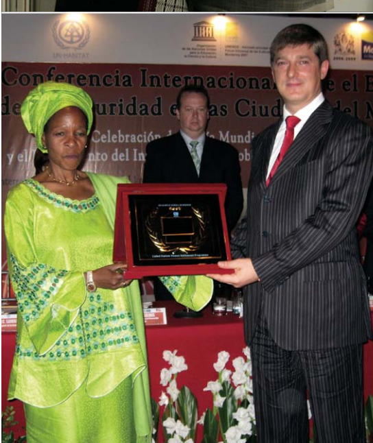
Pervious Habitat Scroll of Honor winners.