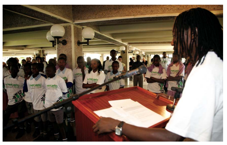
World Habitat Day celebrations in Nairobi, Kenya.

Peponi House school pupils in Nairobi used the UN-HABITAT Kids' Survey to generate discussion on