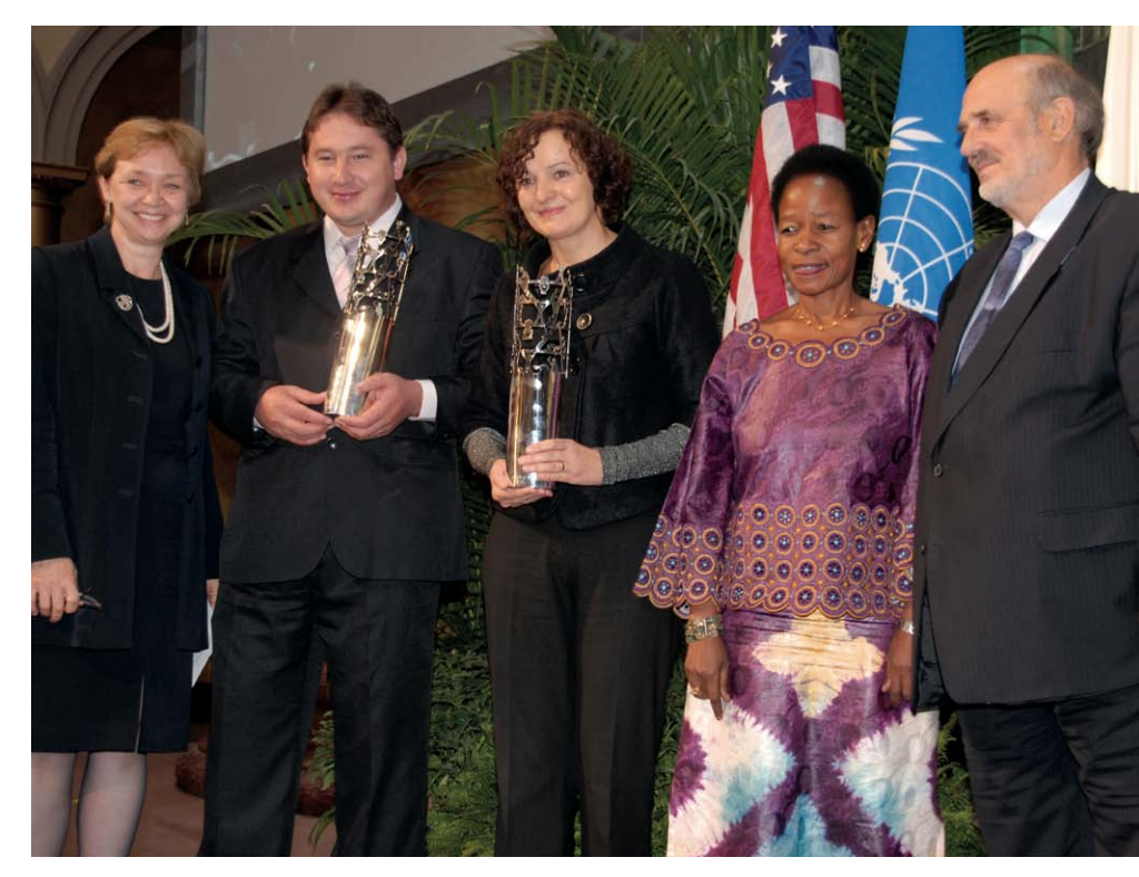
World Habitat Award winners during the global celebrations in Washington DC, USA.

Highlights of the occasion included presentation of the Scroll of Honour Awards, the highest tribute of the UN system for achievements by individuals, cities or institutions in the cause of human settlements. They also included presentation of the World Habitat Award by the Building and Social Housing Foundation and a moving statement from America musician, Jon Bon Jovi whose charitable work includes significant donations for housing for low-income families. He offered a powerful combination of humour and serious soul-searching as he walked the audience through a narrative of how he became involved in efforts