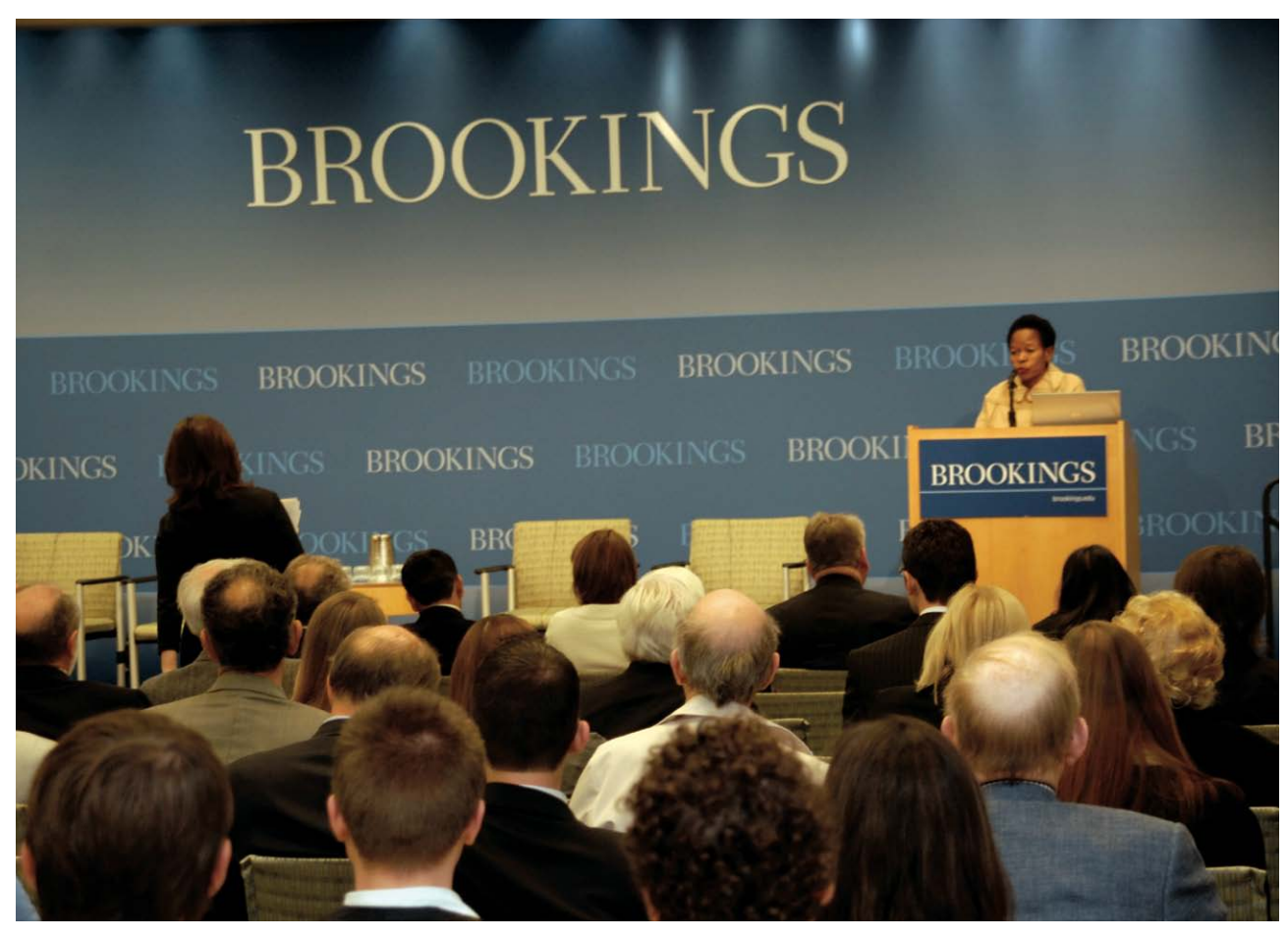
World Habitat Day celebrations in Washington, D.C.

events of the day as well as having them volunteer for the day. Media representatives built side by side with partner families and volunteers to give them firsthand knowledge of the work that homeowners and community volunteers put into these houses. Invitees included the local Brighthouse Networks station, Daytona Beach News Journal, WNZF, the Beach Radio Stations and Brady Publishing.