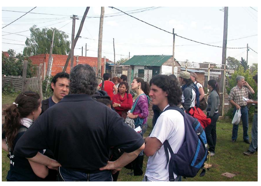
World Habitat Day celebrations in Argentina.

The UN-HABITAT Moscow project office hosted a seminar on urban observatories which brought