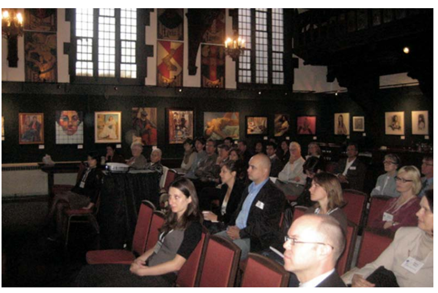
World Habitat Day celebrations in Canada.

Habitat for Humanity Canada and Genworth Financial Canada launched the third annual Meaning of Home Contest – a national contest that challenges pupils across the country to express how important the home is in shaping their lives and the lives of others.