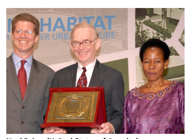
Neal Peirce (United States of America)

For a lifetime of journalism dedicated to reporting cities for a better urban future.