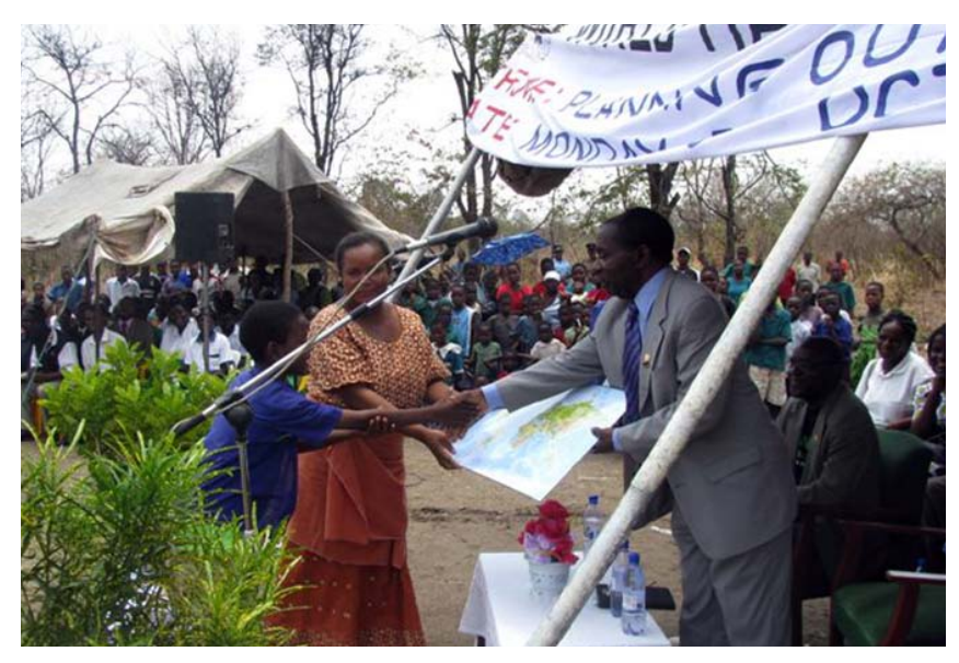
World Habitat Day celebrations in Malawi.

Toris School, in Okearo Agbado Ogun state in Nigeria, celebrated World Habitat Day with a walk around the community and cleaning of designated roads and drainages to educate the community on the