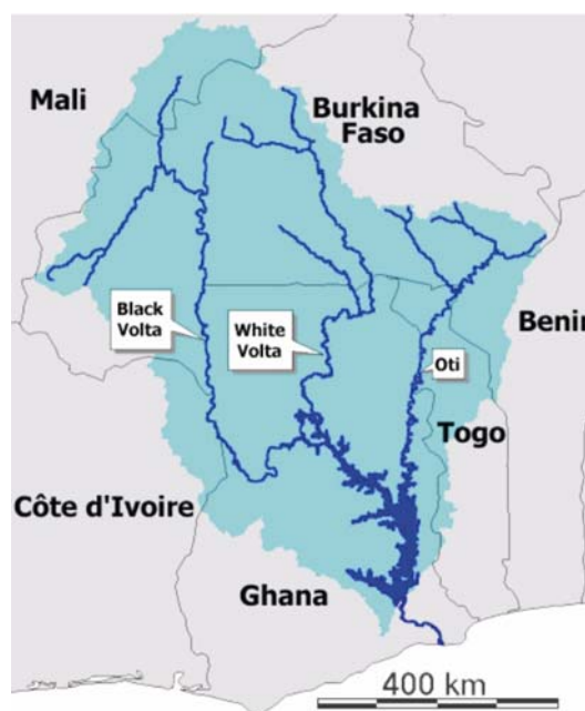
Figure 1. Map of the Volta Basin, West Africa, the main tributaries, riparian countries and Lake Volta. The coast line is that of the Gulf of Guinea.

The geographical focus of this article is the Volta Basin in West Africa, a region often hit by droughts and less frequent floods (Figure 1). Specifically, we look at climate change and adaptation measures in the Volta Basin which covers 400,000 km 2 of which over 80% lies in Ghana and Burkina Faso. The average rainfall is 1000 mm/year with distinct dry (October–May) and wet (May–October) seasons. River discharge is about 9% of total rainfall but varies more from year to year than the rainfall (coefficient of variation of 36% vs 7% for