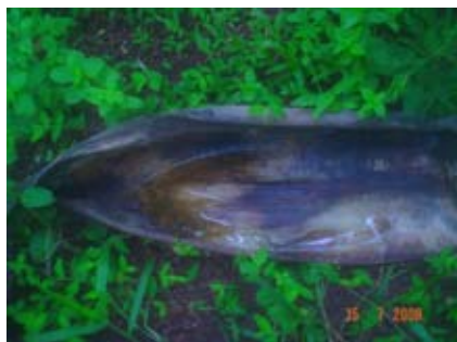
Figure 1. Fallen Areca catechu leaf acting as breeding source of Aedes albopictus .