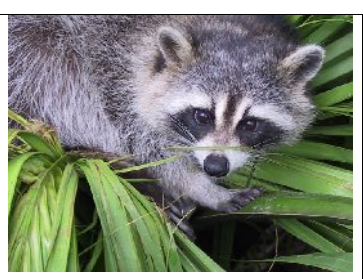
Fig. 3. Examples of four groups of vertebrates (bats, birds, snakes, and non-flying mammals), present in the region of Cuetzalan, and that constituted the focus of the interviews. From left to right, photos correspond to the following species: lesser long-nosed bat ( Leptonycteris curasoae ), red-lored amazon ( Amazona autumnalis ), fer-de-lance snake ( Bothrops asper ), raccoon ( Procyon lotor ).