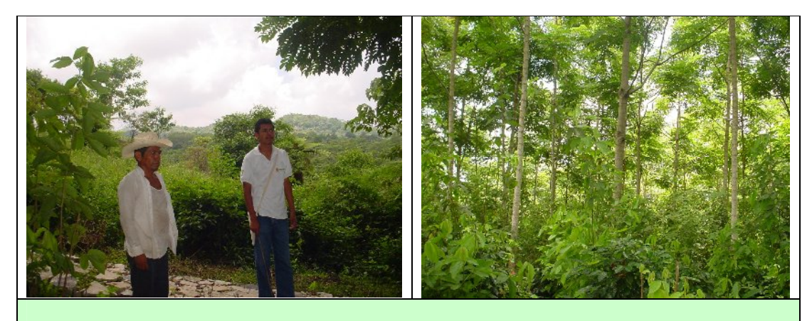
Fig. 2 . The picture to the left shows two of the shade-coffee farmers interviewed in this study, while the picture to the right shows an example of a shade-coffee plantation.