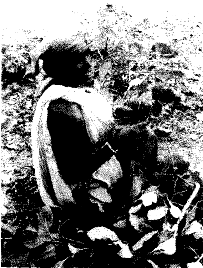
A lady collecting Tendu leaf