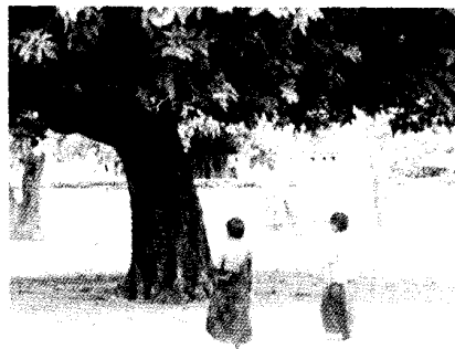
Starting too early

It is believed that thousands of years ago, people of Narayanpur used to live three km away at a village named Bamhani, named after Narayana God's Bamhani incarnation. In the northern part of the village, there is an old lake. The lake has white, pink and red lotuses, which is very rare. The villagers believe this lake also has gold coloured fish which surface only during monsoons. In the western part of the town, there is a temple of Dhanteshwari Devi amidst hillocks. A fair is held every Sunday here. People in this region collect and sell wild food products collected from the forest; vegetables like Khatta Bhaji (sour vegetables), Bohar bhaji , Koliyari bhaji ; fruits like Karmatha , Chironji , Kathal (jackfruit), Aamchur (powdered green mangoes), Cheend ka gud (jaggery made of a fruit similar to date-palm); eatable roots like Kehu kanda , Simi kanda , Dongi kanda ; pulses like Urad , Kulthi , Hirwa , Tikhur and other items like Mahua , Bamboo chutney , Kola ki badi , Mung ki phalli (pod of mung), Siyadi ki rasi , Kumhi ki rasi (rope made of Siyadi and Kumhi), bamboo boxes to store wheat, wooden weapons and vegetables like tomato, brinjal, tamarind, etc. Village markets are a meeting point meant more for socializing, especially for a tribal who lives in an expanded space away from each other. Those who don't value warp and the weft of social capital, cannot imagine, why a tribal travels for two-