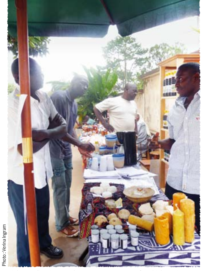
Higher quality gives producers a reason to argue for a higher prices. Here different products are displayed in a market stall in Yaounde.

A few years ago, the Western Highlands Conservation Network, a group of 22 NGOs concerned with conservation, farming, agroforestry and sustainable livelihoods, decided to work together with private and public bodies in order to tackle what was seen as the major difficulty: honey marketing. A thorough market study was carried out with the help of the Netherlands