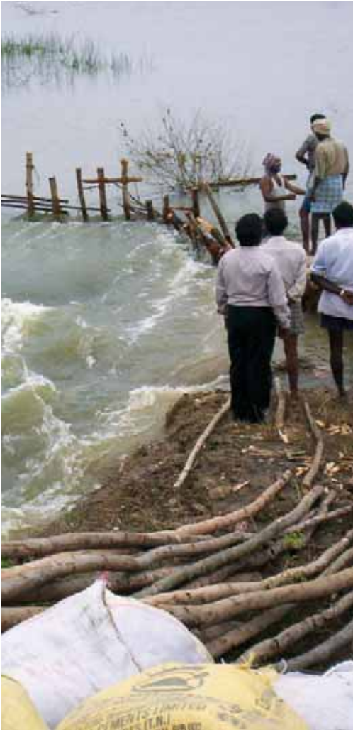
Developing countries are most at risk from climate change. Road flooded in Chennai, India