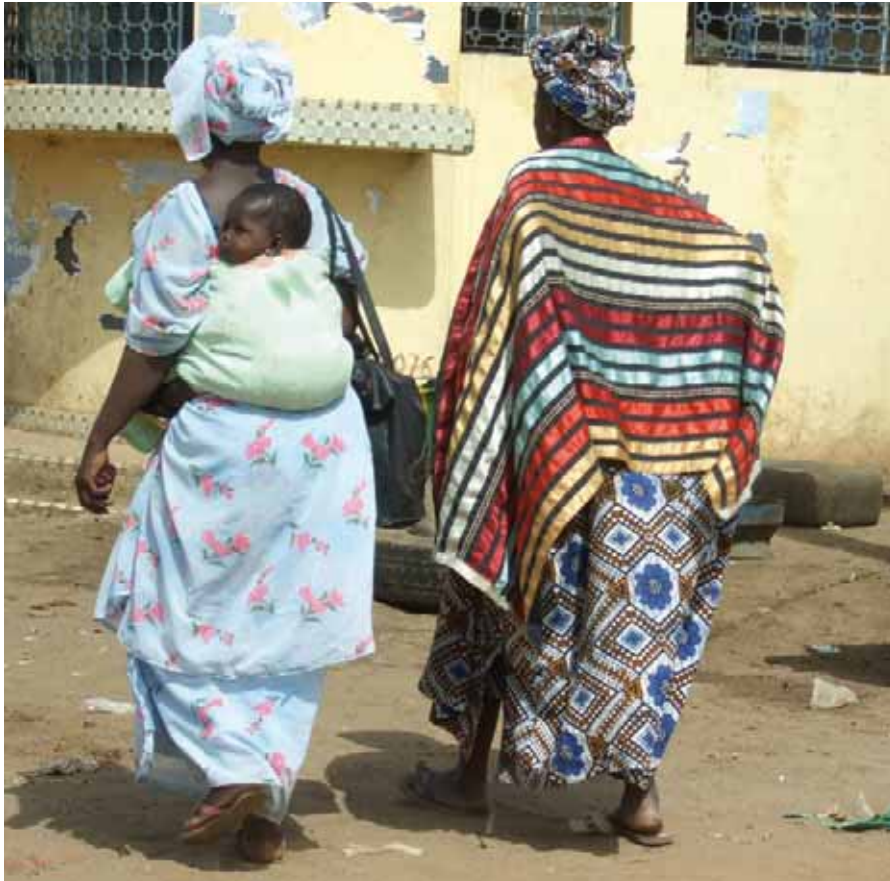
Woman can play an important role in shaping policies regarding climate change

Cities spew out huge amounts of the so-called greenhouse gases responsible for global warming. Seventy-five percent of global energy consumption is thought to take place in cities. At the same time, cities and local authorities in some countries hold tremendous power, leverage and