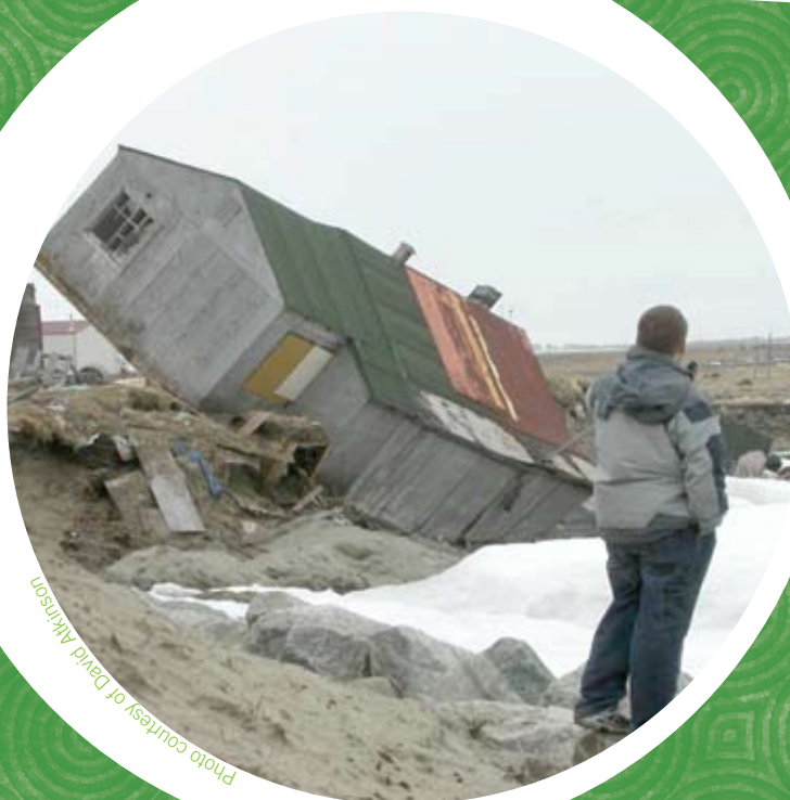
Coastal erosion in Shishmaref, Alaska

With scientific experts now predicting that the effects of climate change will be more severe and appear even faster than previously believed, it comes with little surprise that participants in the Summit from every world region shared observations and experiences of early impacts in their part of the planet. Climate change is not just a theory to us; it is a stark and dangerous reality.