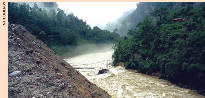
Illegal dumping of muck and debris in the Teesta river during the construction of the now commissioned 510 MW Teesta V project in Sikkim.

1 Kalpavriksh case study on ‘Compliance and monitoring of environmental clearance conditions of the Kameng hydroelectric project’, Arunachal Pradesh (2008). This has also been reported in the CAG report of 2009 on implementation of 10 th Five Year Plan power projects in the Northeast and East by NEEPCO and NHPC.