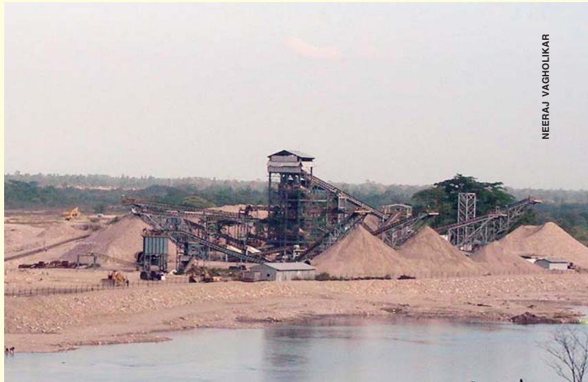
Major quarrying operations in the riverine tracts of the Subansiri, downstream of the dam site of the 2,000 MW Lower Subansiri hydroelectric project. This has disrupted an important corridor for movement of elephants close to the Assam-Arunachal Pradesh border and led to increased human-elephant conflict in nearby areas.

1 The Brahmaputra is called Siang in Arunachal Pradesh and Yarlung Tsangpo in Tibet. The first project being taken up in the lower reaches of the Siang is the 2,700 MW Lower Siang project, a RoR cum storage project.