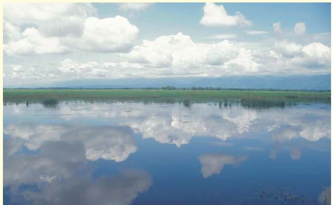
The ecology of wetlands (beels) in the Brahmaputra valley is intricately connected with the rivers. Dam-induced changes will also impact the downstream wetlands and those whose livelihoods are dependent on these.

The flow during peak load water releases in the Subansiri river in winter will be equivalent to average monsoon flows and will cause a