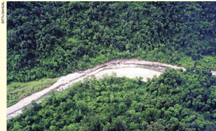
Biodiversity-rich ecosystems on the Assam-Arunachal Pradesh border will be negatively impacted by the under-construction 2000 MW Lower Subansiri hydroelectric project.

The Brahmaputra 4 is one of the world's largest rivers, with a drainage basin of 580,000 sq km, 33% of which is in India. Originating