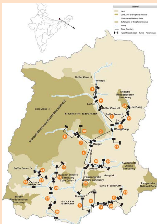
Plans for multiple large run-of-the-river hydropower projects in Sikkim will leave virtually no stretch of the Teesta river flowing free

MAP NOT TO SCALE/ SANCTUARY ASIA, ADAPTED FROM MAP OF DEPARTMENT OF HYDROPOWER, SIKKIM.