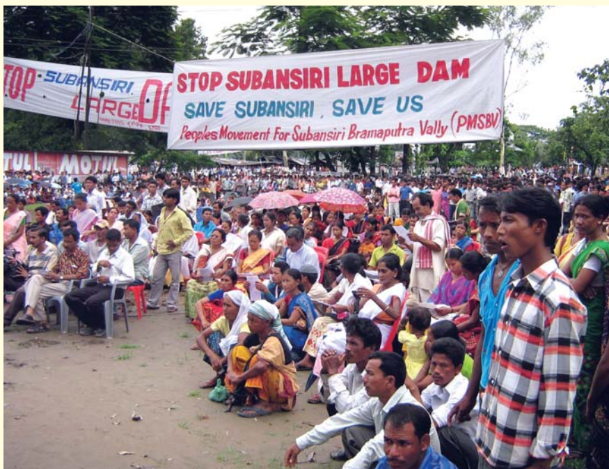
Local movements make their presence felt at a rally downstream of the under-construction 2,000 MW Lower Subansiri hydroelectric project organised by the Mising Students Union and the Krishak Mukti Sangram Samiti.