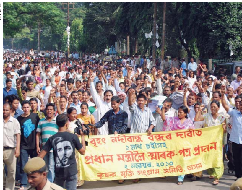
A protest rally against large dams in the Brahmaputra river basin held in Guwahati in November 2010.