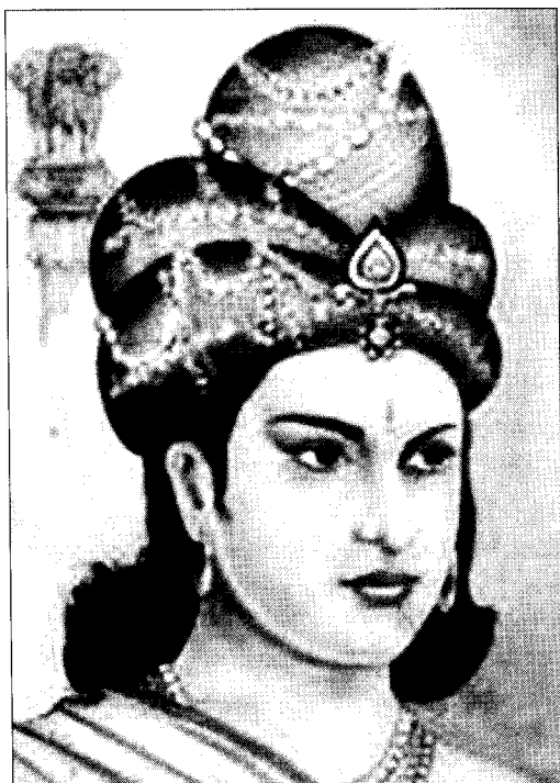
Figure 2. Emperor Ashoka (reign 273–232 BC).

Gods, King Piyadasi , made provision for two types of medical treatment: medical treatment for humans and medical treatment for animals. Wherever medical herbs suitable for humans or animals are not available, I have had them imported and grown. Wherever medical roots or fruits are not available I have had them imported and grown. Along roads I have had wells dug and trees planted for the benefit of humans and animals.”