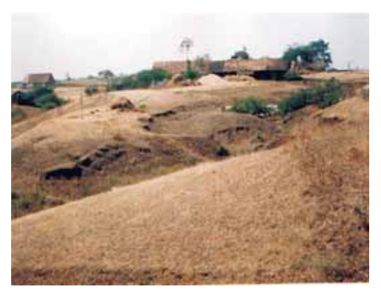
Figure 1 The undulated terrain coupled with scattered houses pose a challenge to project implementation at Dageriya

villagers have been found optimistic and receptive, and their response to the work was very encouraging.