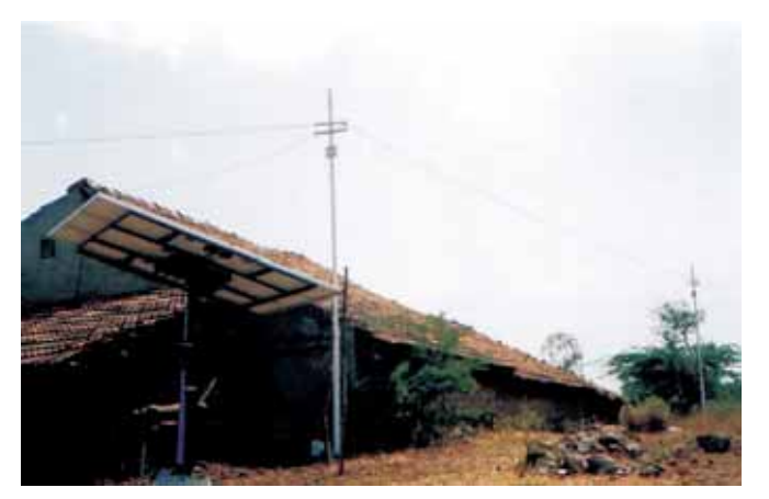
Figure 5 Pole-cable network in a cluster