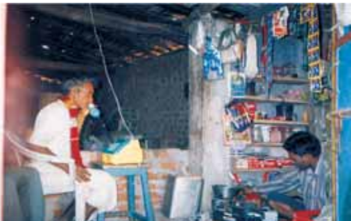
Figure 9 Newly opened shop with telephone