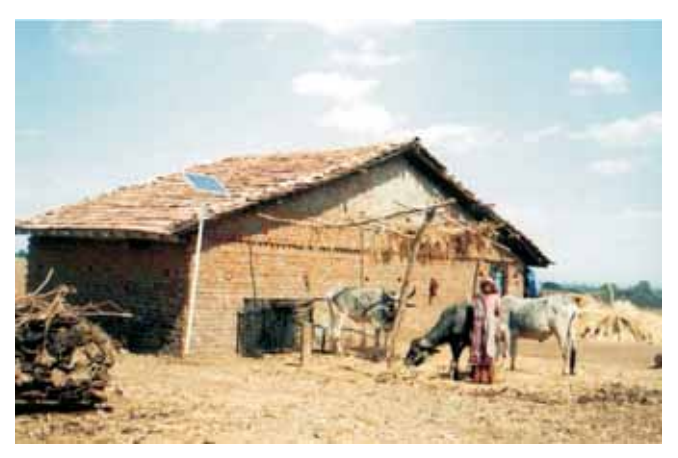
Figure 6 Home light system in an isolated house