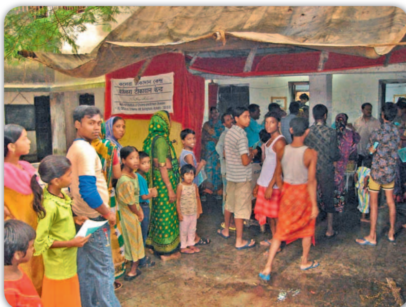
Floods did not deter people from coming for the vaccine.

Cases of cholera reported to WHO worldwide have increased steadily since 2000. From 2004 to 2008, a total of 838 315 cases globally were notified to WHO. This represents