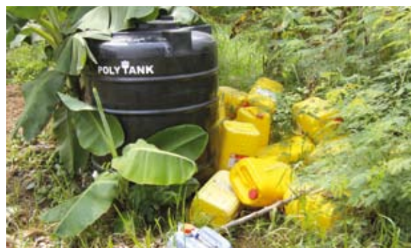
Urine storage tanks at the testing site in Accra