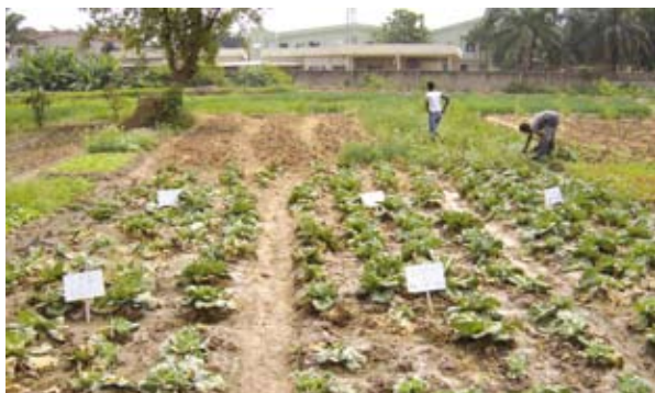
Testing of urine application and co-composting products in Accra

Accra, like Ibadan, is experiencing rapid population growth and agriculture is becoming a clear feature in the urban fringes. It is one of ten demonstration cities under the EU funded Project "Sustainable Urban Water Management Improves Tomorrow's City's Health (SWITCH)", one component of which is developing options to effect improvements in agricultural production and other livelihood activities using freshwater, storm and wastewater (see also UA-Magazine no. 20 or www.switchurbanwater.eu ).