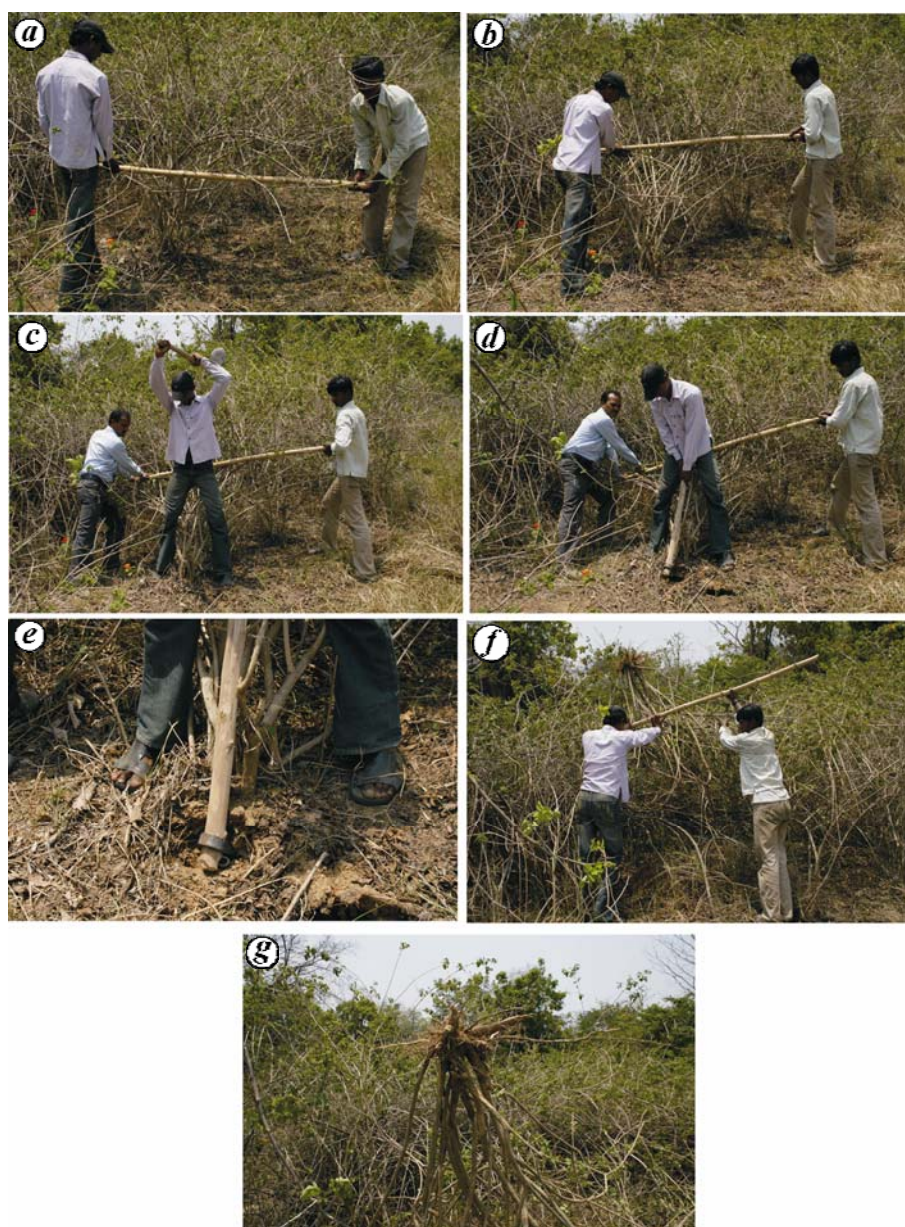
Figure 2. Sequential steps (a–g) involved in the removal of Lantana by cut rootstock method.

a forest ecosystem, the native bottom–up woody species that process the habitat can be planted along with grass species or can be introduced in a sequential manner. Ecological restoration should be carried out concurrently with removal of Lantana without much of time lag. The species assemblages of grasses and legumes used for ecological restoration vary across the ecological gradients, and thus the species of grasses and legumes selected for restoration are site-, locality- and region-specific.