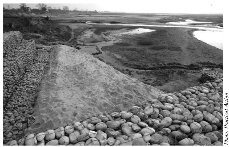
Flood defences in place, Nepal

As a result, it is scarcely surprising that considerable efforts are being made to reduce the greenhouse gas footprint of livestock farming. With CDM funding, biogas digesters are being built to reduce methane emissions from factory farms. Nitrification inhibitors<sup>27</sup> are being propagated that could inhibit nitrous oxide, although they are far from efficient, practical or affordable. Endeavours are being made to lower the feed conversion ratio – that is, the amount of feed required to produce meat, eggs and milk. Indeed, faster livestock growth and better use of feed have been achieved over recent decades. Proponents of industrial farming are now claiming