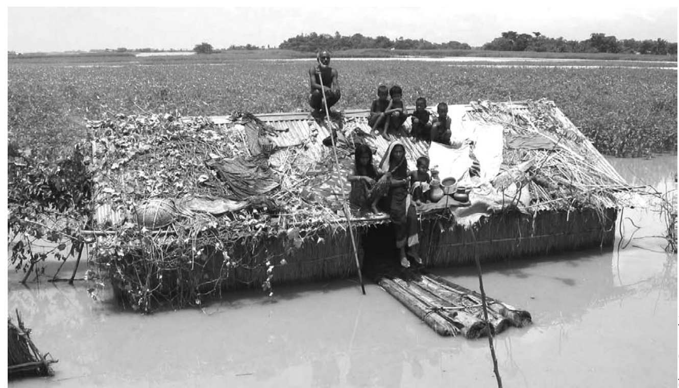
Family members take refuge on their roof during severe flooding in Bangladesh. The perennial hazard is made much worse by climate change

33 IUCN, "Misconceptions surrounding pastoralism", 21 November 2008 (accessed 20 May 2009), http://tinyurl.com/I5b253