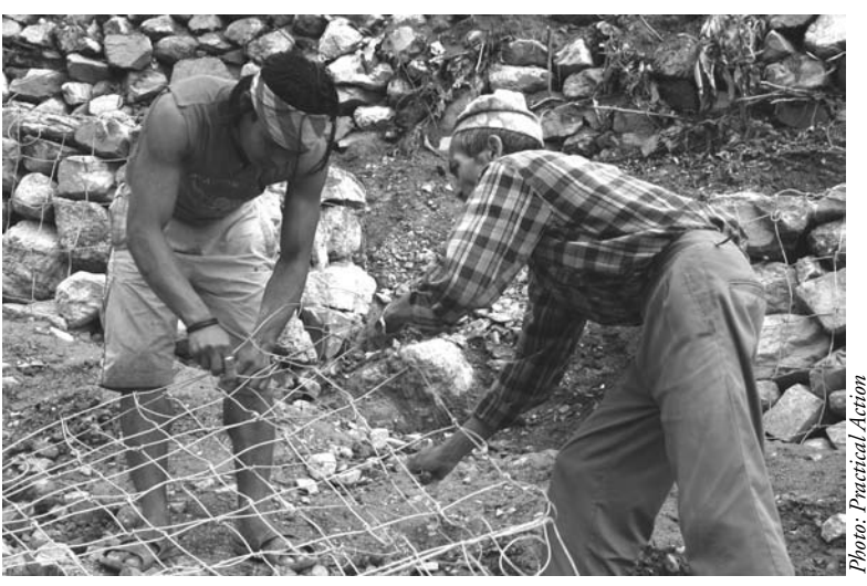
Constructing riverbank reinforcements to act as flood defences, Nepal