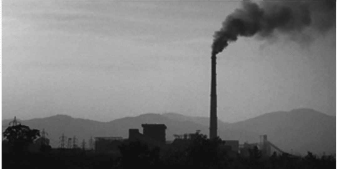
Vedanta's alumina factory at Lanjigarh, south-west Orissa