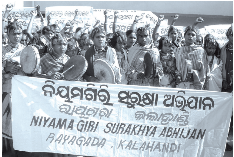
Peaceful but determined resistance to Vedanta’s project

Even the Dongaria were vulnerable, however, to the seductive charms of “modern civilisation”. Attracted by the promise of higher yields, some