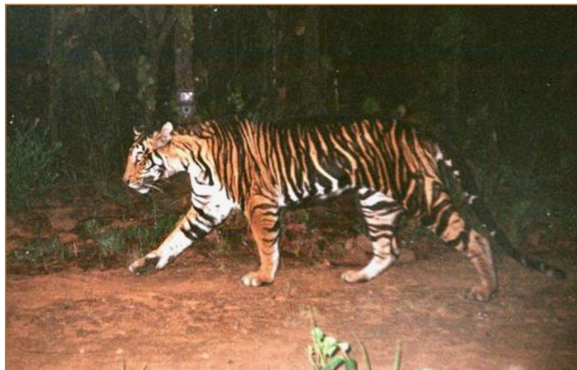
Simlipal is the only place in the world that has recorded “black tigers”. This is one of a number of reasons why it is imperative that Simlipal Tiger Reserve receives the highest degree of protection and support, and that it is managed professionally, with dedication and diligence.