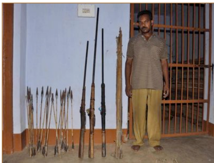
Country-made guns and bows and arrows seized at at Dhobighat, Thakurmunda Range, on 12 June 2010