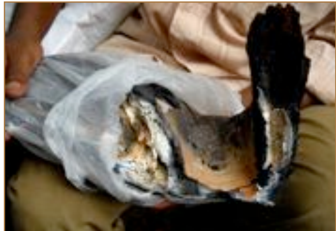
No. 4 - Charred bone in the custody of DFO Baripada

There was no skull, but two charred bones (one looks like a large tusk casing) from this site were handed over to the DO Baripada for further investigation.