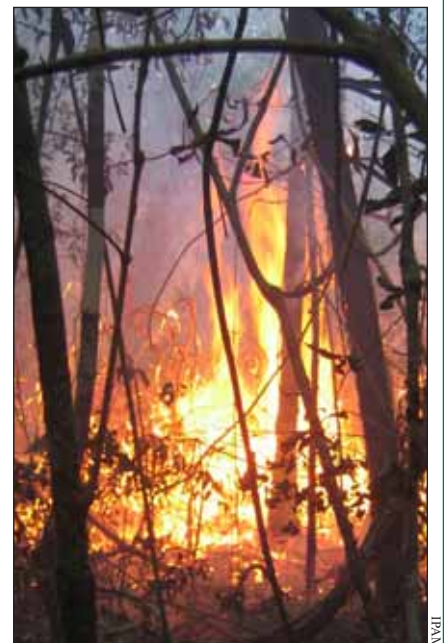
Deforestation, degradation, and poor harvesting and slash-and-burn agricultural practices lead to high fire risk for millions of hectares of Amazon forests

Brazil is one of the world's top producers and exporters of sugar cane, soybean, oranges and other products (FAO, 2008). In the nine states of the Brazilian Amazon, the area under intensive mechanized agriculture grew by more than 3.6 million hectares from 2001 to 2004 (Morton et al. , 2006). Particularly during this period, the greatest increase in area planted to soybean was in Mato Grosso, the Brazilian state with the highest deforestation rate (40 percent of new deforestation). By displacing cattle ranchers, soybean production has pushed the Amazon deforestation frontier further north. Between 2001 and 2004, the area deforested for cropland and mean annual soybean price in the year of forest clearing were directly correlated (Morton et al. , 2006). Forces driving the expansion of mechanized agriculture include lower transportation costs as a result of improved local infrastructure (roads, railroads, ports and waterways); higher international soy-