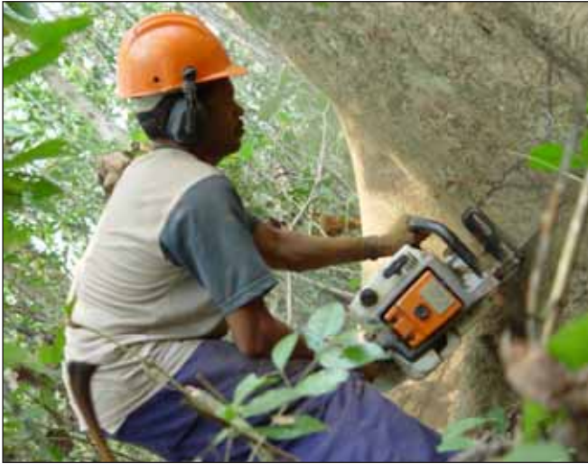
Unsustainable harvesting practices increase forest degradation and related biodiversity loss (Acre, Brazil)