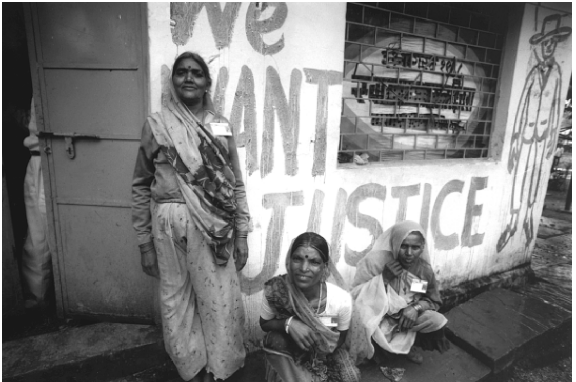
Women from the survivors' organization (Gas Peedit Mahila Stationery Karmachari Sangh) on the 15th anniversary of the Bhopal accident.