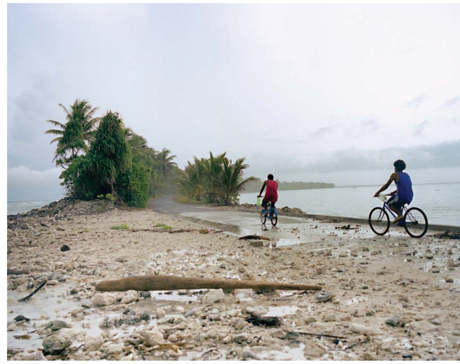
Funafuti, Tuvalu. The narrowest part of Fogafale Islet is just 20 metres in width. During king tides and storm surges, water and debris from the ocean wash right into the lagoon. Tuvalu Prime Minister Apisai Ielemia has made a strong plea "to all to act quickly and responsibly to ensure countries like Tuvalu do not disappear".

"Climate change also impacts our human rights. It impacts international peace and our own security, territorial integrity and our very existence, as inhabitants of the very small and vulnerable island nations."<sup>21</sup>