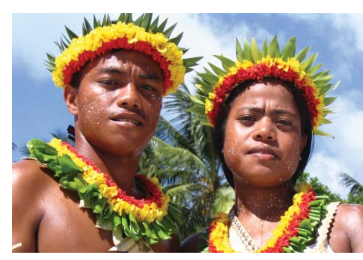
Teaoraereke, Kiribati. Two young dancers in traditional dress show pride in their culture. Australia and New Zealand need to contribute their fair share of what is needed to address climate change in the region and support Pacific neighbours to become resilient climate change survivors.

These steps simply represent Australia and New Zealand's fair share of what is needed to address climate change in the region and support our neighbours to become resilient climate change survivors.