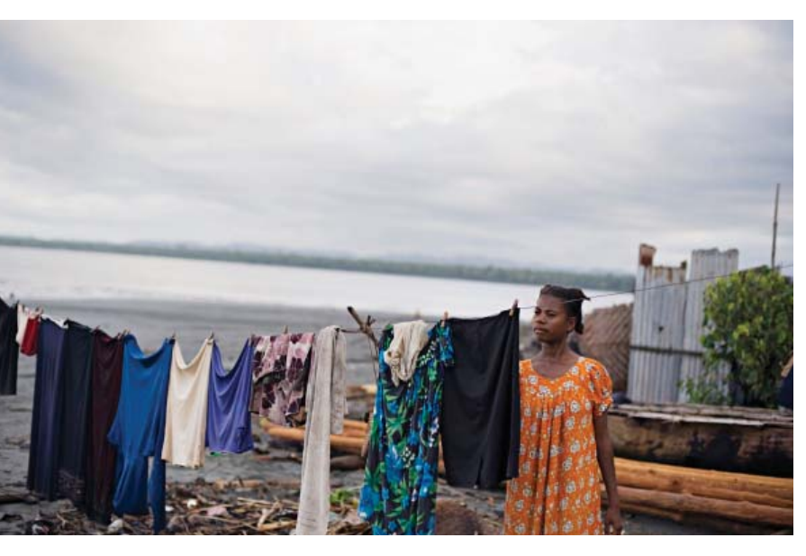
A girl hangs up her family's washing on a beachside shanty town just out of Kerema, the provincial capital of Papua New Guinea's least developed province, the Gulf Province, Papua New Guinea, Friday, May 29, 2009. Such coastal settlements are at great risk from rising sea levels.

"We strongly believe that it is the political and moral responsibility of the world, particularly those who caused the problem, to save small islands and countries like Tuvalu from climate change, and ensure that we continue to live in our home islands with long-term security, cultural identity, and fundamental human dignity. Forcing us to leave our islands due to the inaction of those responsible is immoral and cannot be used as quick-fix solutions to the problem."