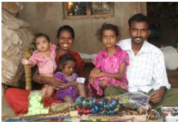
Income sources are diversifying