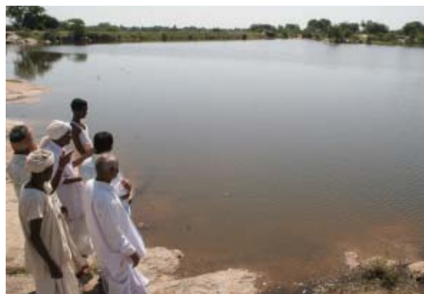
Adapting to climate change by conserving water

MPRLP has recently initiated a scoping study of how carbon markets can be used to support rural livelihoods in Madhya Pradesh, and DFID is also supporting training in the preparation of carbon offset projects in both Madhya Pradesh and Orissa. We are also designing a Climate Change Innovation Programme with the Ministry of Environment and Forests that will focus on helping the poor adapt to climate change and benefit from any opportunities offered by the carbon market. We are hopeful that a post-Kyoto agreement on climate change will deepen and widen the continuation the carbon market, unlocking new opportunities for the rural poor to participate.