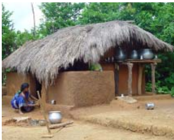
Programmes focus on the socially excluded tribal groups