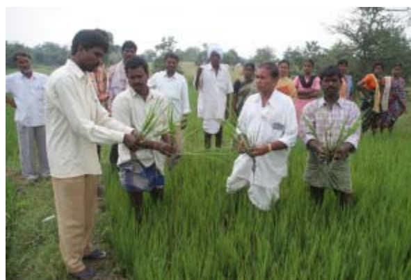
New technologies are promoted

Both APRLP and MPRLP are working in partnership with others to promote jobs and vocational training schemes. In Andhra Pradesh, 8,200 rural youths are being provided with skills and job placements through skills development, whilst another 1,512 are being trained in electronic skills areas to meet the growing demand from companies in the State.