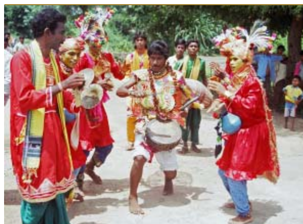
Kalajatha programmes are used to spread messages

A range of different mechanisms have been adopted to share lessons. These include the stakeholder Livelihoods Forum in Madhya Pradesh, independent impact assessments, research and documentation and annual experience sharing events across programmes. There is a strong emphasis on piloting, demonstrating and learning from new approaches, sharing these with government departments and working to ensure that they are mainstreamed within long-term schemes and programmes of the relevant line departments.