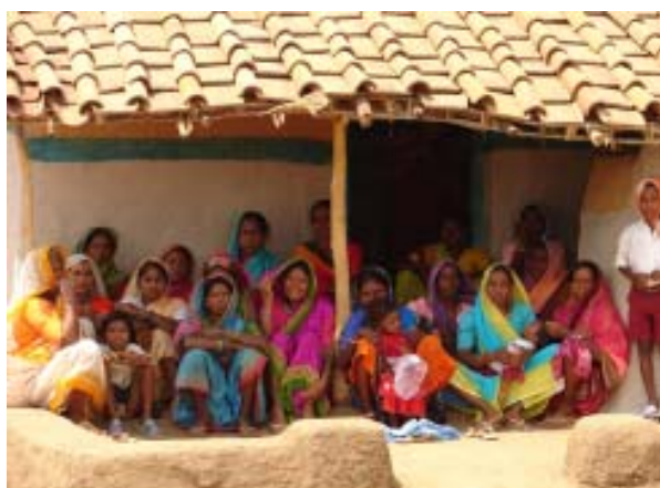
Progress is driven by women's self-help groups

The next generation of DFID support focused on the watershed based development programmes of the Government of India, initially in three states. DFID support transformed these from natural resource programmes focus, emphasising physical conservation works and primarily benefiting larger, mostly male, landowners, to people centred programmes, inclusive of all the residents of the watersheds and paying particular attention to landless, women and other vulnerable groups. This has become known as a 'watershed plus' approach. Specific elements of the 'plus' are components for productivity enhancement and micro-enterprise promotion with earmarked funding, as part of a broader approach that includes enhanced participation, capacity building and innovation.