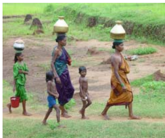
Participation could overburden women