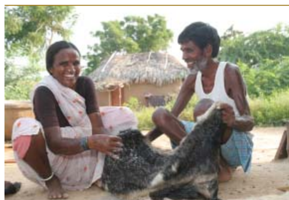
There is a gradual change in gender relations