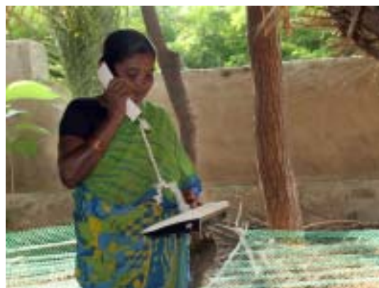
Telephones open up access to new markets