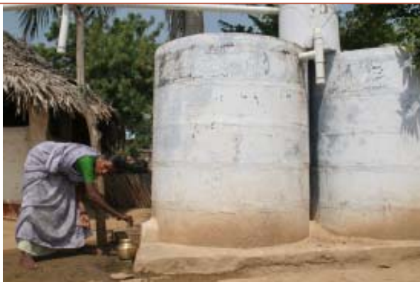
Access to safe drinking water has increased

Income has increased and income sources are diversifying, particularly for socially-excluded groups. The Andhra Pradesh Rural Livelihoods Programme has moved an estimated 1 million people above the poverty line and incomes of the poorest and of women headed households have risen by 85% and 92% respectively over the project period (as against 56% and 37% for non-beneficiaries). Across the Andhra Pradesh and Orissa programmes, food availability has improved during the traditionally “hungry months”. Households report fewer days without sufficient food, increased production of staple food crops, or increased access to food through food-for-work schemes.