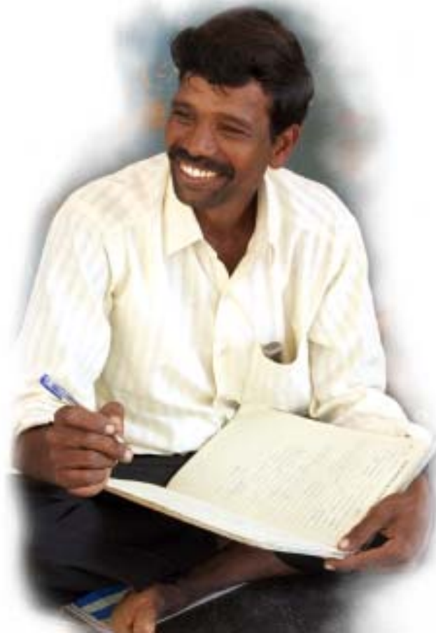
Villagers are trained to maintain their own records