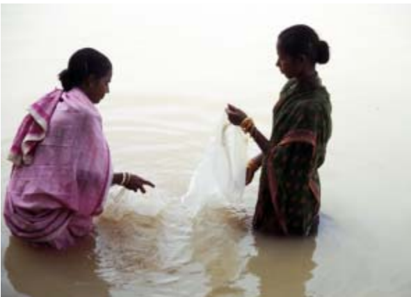
Diversification of livelihoods through pisciculture