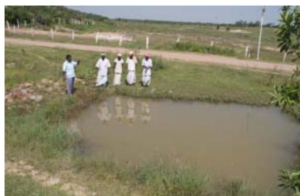
Watershed associations play an important role