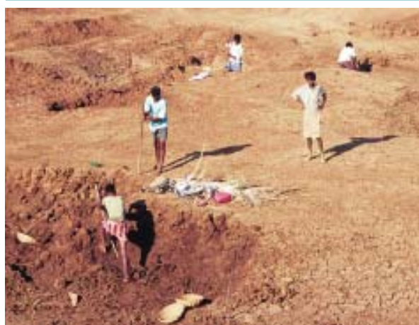
Tank silt improves soil fertility

While structures under the watershed programme, such as percolation tanks, recharged wells in the area, formerly landless people, and others in the village, were being provided with technical inputs and advice by local field staff as well as NGO members. In addition, the villagers were supplementing their agricultural income through a variety of enterprise initiatives promoted through the self-help groups and Village Organisations under the APRLP.