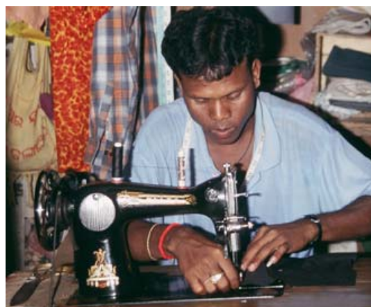
New machines lead to improved livelihoods