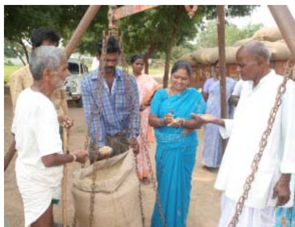
Empowered women hold their own