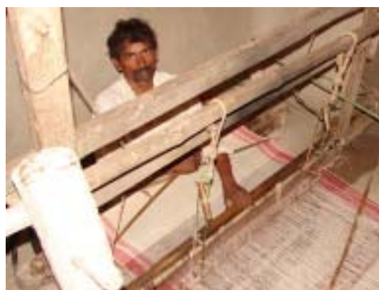
Traditional skills need new markets