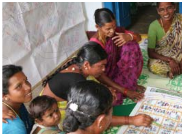
Self-monitoring by self-help groups

these assemblies are meeting regularly, becoming more inclusive of women and marginalised groups, and are making decisions and using funds for the purpose intended. There has been good progress in fund disbursements and in strengthening transparency and accountability at village level. The process of establishing micro-plans, requesting and utilising funds has been well coordinated by these assemblies.