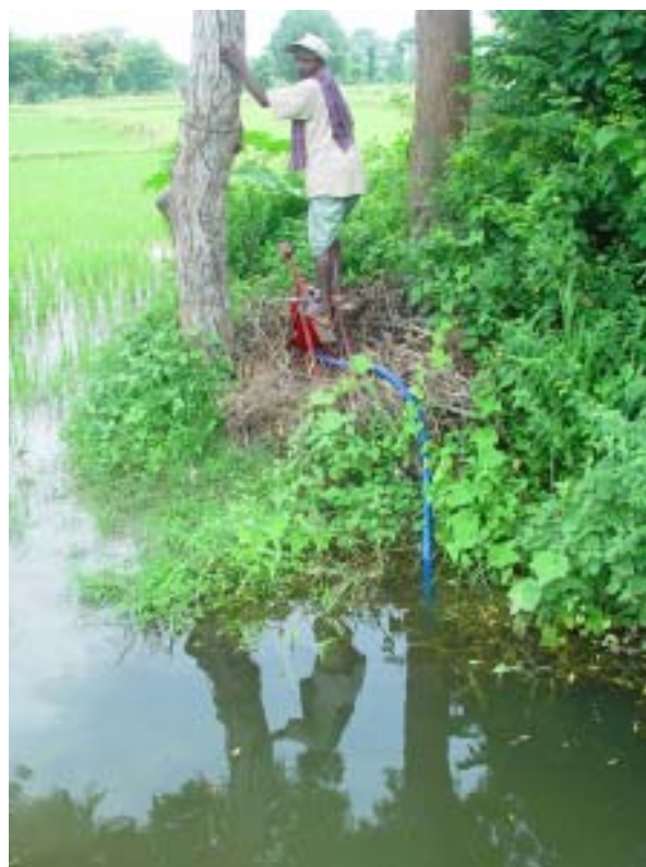
Micro-irrigation using a step-pump

Whilst watershed management activities have brought many benefits, there is a danger that they may also contribute to unintended consequences, including reduced inflows to traditional tank systems, catchment closure and groundwater overdraft. Given that there is limited scope for increasing water resources, the emphasis needs to shift towards improved management of existing water resources and, in particular, ensuring that allocation of water to meet primary needs has priority. This requires an efficient and equitable water governance system for using and allocating available water resources. APRLP has contributed in this area, developing tools such as water audits, which can assist decision makers to make informed decisions about water, taking into account issues of equity, sustainability and efficiency.