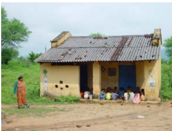
More children are being sent to school

Programmes have enhanced the role of women in household decision making and in gaining improved access to services. For example, in Western Orissa, 65% of women from poorest households reported increased access to their entitlements from Government schemes as a result of campaigns by women’s self-help groups.