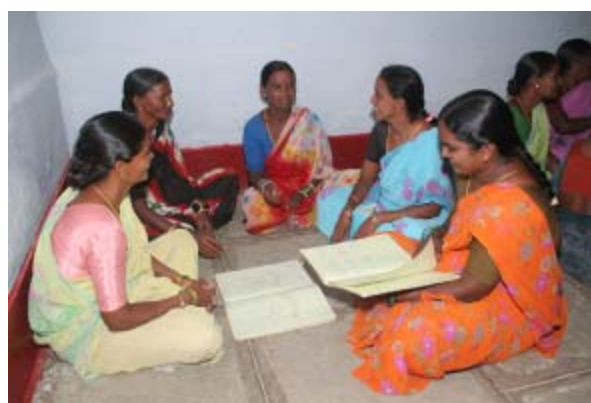
Self-help groups are supported