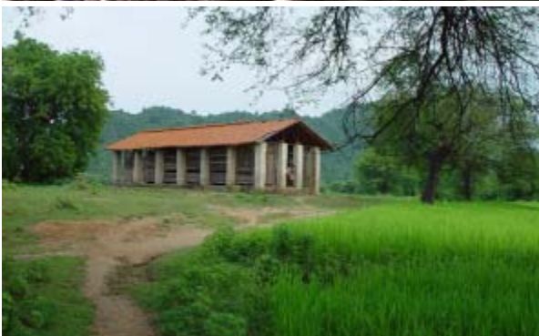
Onions and a low cost onion storage shed