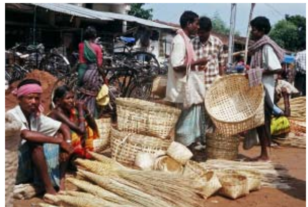
New markets for traditional artisans