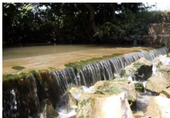
Watershed management through conservation structures