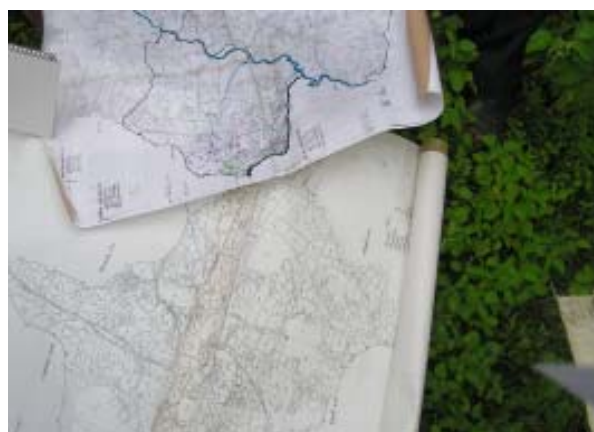
Using maps to help design and implementation