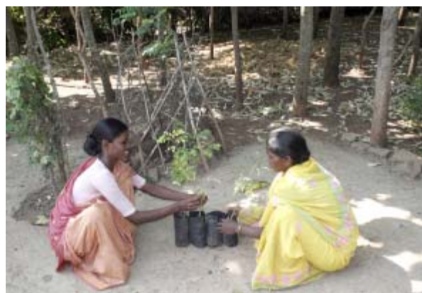
Can poor people gain carbon credits by planting trees?