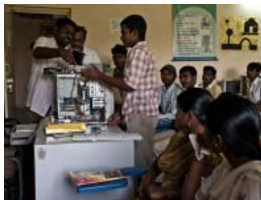
Training helps the rural youth get jobs in the IT sector

India's rapid economic growth and development cannot continue to miss out the rural poor. The challenge is to make this growth more inclusive, and, given the growing pressure on natural resources and the mounting threat posed by climate change, to make it more sustainable. New technologies, including those associated with information and communications can help to drive this change and to accelerate the transition out of poverty in rural areas. The private sector is now the major driver of growth in the Indian economy and could potentially play an increasingly important role in opportunities for the rural poor to become key players in India's economic growth. While some work has been initiated on information technology and on engaging the private sector in promoting new technologies and linking the poor to markets, we see both of these issues playing an increasingly important role in rural livelihoods approaches in the future.