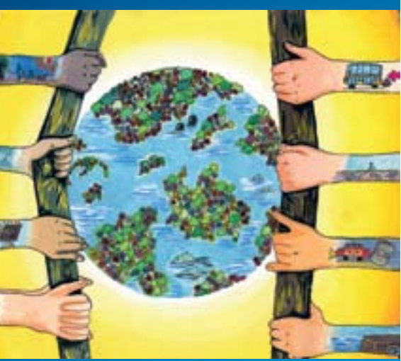
© Gloria Ip Tung / 14 years / China

Europe, as well as to promote standard-setting for certain technologies. UNEP has developed technical documents on measures to improve industrial energy efficiency, for use by dedicated centres in developing countries — an approach that has been tested with some of the centres in the joint UNIDO-UNEP network of National Cleaner Production Centres.