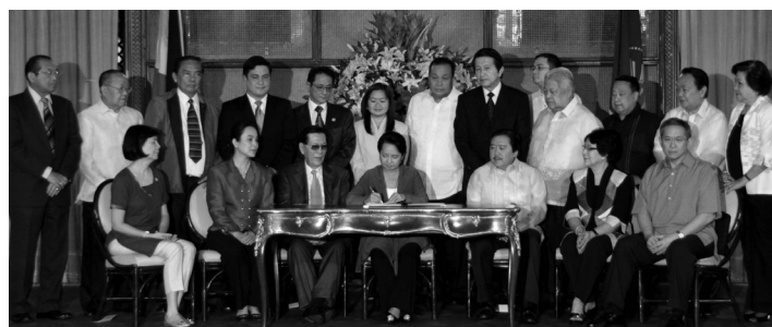
Philippines. Landmark legislation on climate change and disaster risk reduction was signed into law on 23 October 2009 by President Gloria Macapagal Arroyo, witnessed by Senator Loren B. Legarda, its author and sponsor, and Senate President Juan Ponce Enrile, Rizal Hall, Malacanang Palace.

The Forum aimed to promote the use of accumulated disaster risk reduction experience. While the two