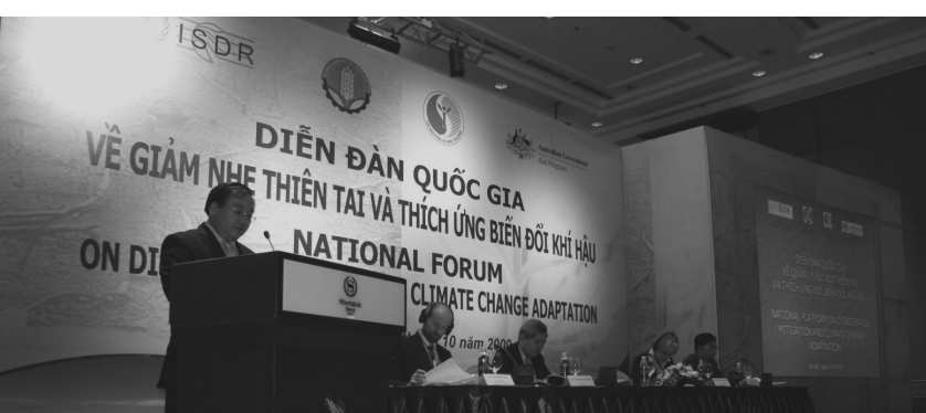
Viet Nam. Deputy Prime Minister Hoang Trung Hai opens the National Forum on Disaster Risk Reduction and Climate Change Adaptation, 7 October 2009, lending his support to efforts to deal with both issues jointly.

High-level political leadership helps overcome institutional barriers. The National Forum was hosted by the Deputy Prime Minister, whose leadership stressed national interest and collaboration between ministries. In Viet Nam, the Ministry of Natural Resources and the Environment is the lead agency for climate change coordination, while the Ministry of Agriculture and Rural Development maintains overall responsibility for rural development and disasters. A number of international organizations, such as the Australian Agency for International Development, UNDP, UNISDR, and the World Bank’s Global Facility for Disaster Reduction and Recovery played a role in supporting the Forum and assisting in the development of strengthened cross-sectoral cooperation and synergy.