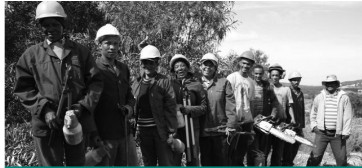
South Africa. Clearing invasive alien plants from waterways is part of Overstrand Municipality's comprehensive water management strategy, and has provided jobs and training to thousands of people.

In a recent study by reinsurance firm Munich Re, London was ranked the ninth most vulnerable major city to the impacts of climate change. Already in this decade, the capital endured floods in 2000, 2002, 2007 and 2008, droughts in 2006 and heat-waves in 2003 and 2006. The work on