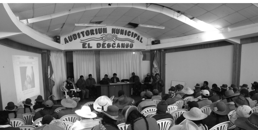
Peru. Meetings of local communities in the Andean highlands were organised by a consortium of NGOs to discuss climate change and measures to address water shortages.

Disaster risk reduction is embedded into the institutional framework for the national and local climate change policy. Under the new Act, a Climate Change Commission headed by the President of the Philippines will be created as the sole governmental policy-making body on climate change. Its primary function is to "ensure the mainstreaming of climate change, in synergy with disaster risk reduction, into national, sectoral and local development plans and programmes". The Act also gives local governments the primary responsibility for planning and implementing local climate change action plans, which will be consistent with national frameworks.