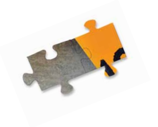
MANY THANKS We will keep you informed.