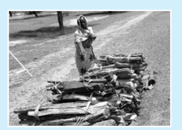
Figure 3: Mrs Akhaye Harouna of Midekhine village in Chad prepares bundles of wood.