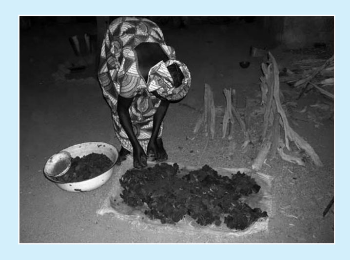
Figure 7: Juliette makes piles of charcoal for sale in Burkina Faso.

In both Senegal and Niger, women charcoal traders were paying into a tontine fund, where they typically made daily deposits of between 100-1000 FCFA which they then receive back at the end of the month. This regular form of income provides a useful addition to the daily profits from their charcoal selling activities. In Burkina Faso, women pack charcoal into bags which they then sell for 50 to 100 FCFA, ending up with a net profit of between 1,500 and 2,000 FCFA per day.