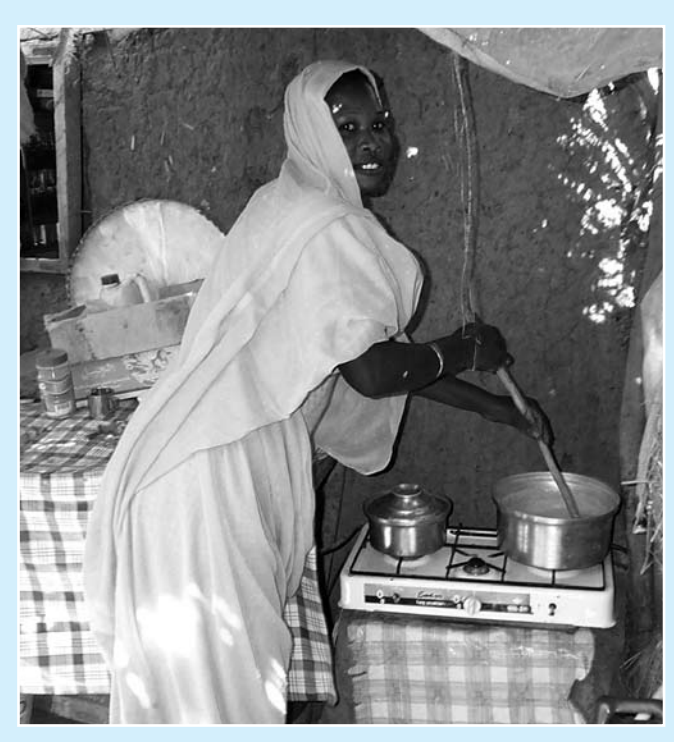
Figure 10: Although not a focal country of CILSS/PREDAS, in neighbouring Sudan a women cooks on an LPG stove in Kadugli, a camp for displaced and marginalised people on the outskirts of Kassala.