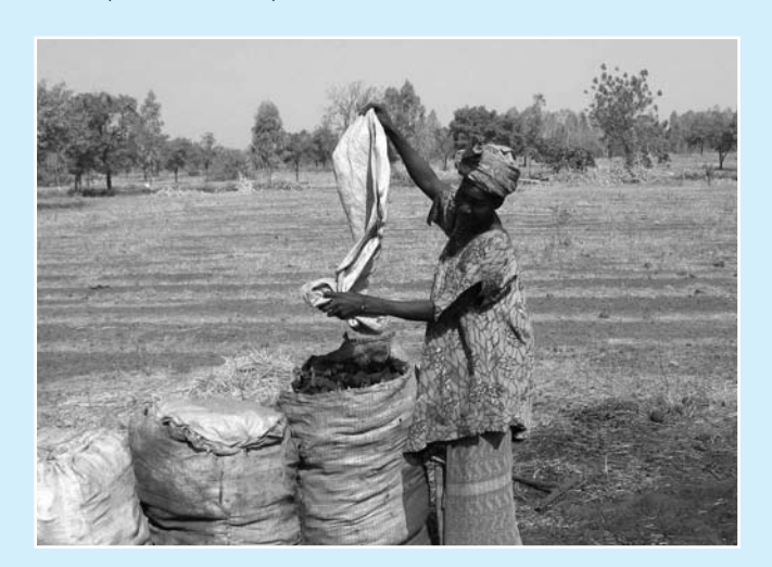
Figure 6: Mrs Alima Sacko packs charcoal into bags in Kassela, Mali. She produces between 10 to 15 big bags of charcoal every week and sells each one for around 3,000 FCFA.