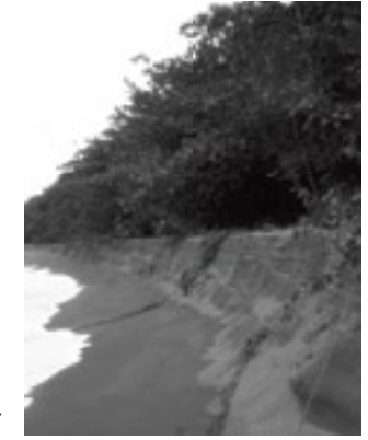
Coastal erosion, Costa Rica

found that limb length in one species is temperature-dependent and thus would indicate a certain adaptation potential to a range of climates<sup>61</sup>. One possible approach to estimating adaptive capacity would be to estimate exposure to past climate change over evolutionary time in conjunction with dispersive capability. Research has shown that many species have shifted ranges with past climates (showing that the rate of change did not exceed dispersal capability), while others have evolved in climates that have been stable for millions of years. Those species that have evolved in situ with a stable climate can show high degrees of specialization and frequently have evolved obligatory mutualistic relationships with other species, such that extinction of one species would lead to extinction of the partner. Such factors should be included in risk assessments concerning the impacts of climate change on biodiversity as outlined in box 1 on page 21 below.<sup>62</sup>