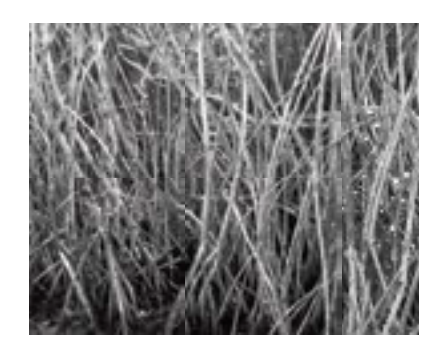
Mangroves, Quintana Roo, Mexico

logging reduce the standing stock of biomass carbon, cause collateral losses from soil, litter and deadwood and have also been shown to reduce biodiversity and thus ecosystem resilience.<sup>199</sup> This creates a carbon debt which can take decades to centuries to recover, depending on initial conditions and the intensity of land use.<sup>200</sup> Conserving forests threatened by deforestation and forest degradation and thus avoiding potential future emissions from land use change is therefore an important climate change mitigation opportunity for some countries.<sup>201</sup> Avoiding potential future emissions from existing carbon stocks in forests, especially primary forests, can be achieved through a range of means<sup>202</sup> including: