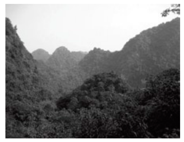
Vietnam, Photo courtesy of Mathieu Rossier

important in the global carbon balance. For example, during the 1990s it is estimated that while 6.4 \pm 0.4 Gt C per year were emitted from combustion of fossil fuels, 0.5-2.7 Gt C per year were released by land-use activities (e.g. deforestation, land-use change and land degradation). However, another 0.9 to 4.3 Gt C per year was taken up by the residual land sink as a result of enhanced growth of terrestrial vegetation from CO_2 fertilization; additional nitrogen released by human activities and increased temperature. Marine ecosystems exchange even greater amounts of carbon with the atmosphere (about 90 Gt C per year) and on average store about 2.2 \pm 0.4 Gt C per year.