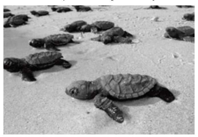
Hawksbill turtles, Nicaragua, Photo courtesy of Sonia Gautreau

polar and alpine species<sup>27</sup> and species restricted to riverine<sup>28</sup> and freshwater habitats<sup>29</sup>. Local extinction of species often occurs with a substantial delay following habitat loss or degradation. Accumulating evidence suggests that such extinction debts pose a significant but often unrecognized challenge for biodiversity conservation across a wide range of taxa and ecosystems<sup>30</sup>. Shifts in distributions of native species as an adaptive response to climate change will challenge current wildlife and conservation management practices and approaches.