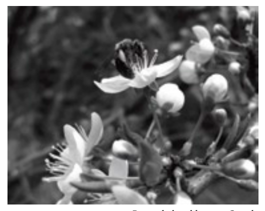
Bee and plum blossom, Canada

118. Climate change increases the risk of reductions in crop and livestock yields. Within a given region, different crops and livestock are subject to different degrees of impacts from current and projected climate change. <sup>141</sup> In light of this, the adoption of specific crops, livestock or varieties in areas and farms where they were not previously grown are among the adaptation options available to farmers. <sup>142</sup> Further, the use of currently under-utilized crops and livestock can help to maintain diverse and more stable agroecosystems. <sup>143</sup> Conserving crop and livestock diversity in many cases helps maintain local knowledge concerning management and use.