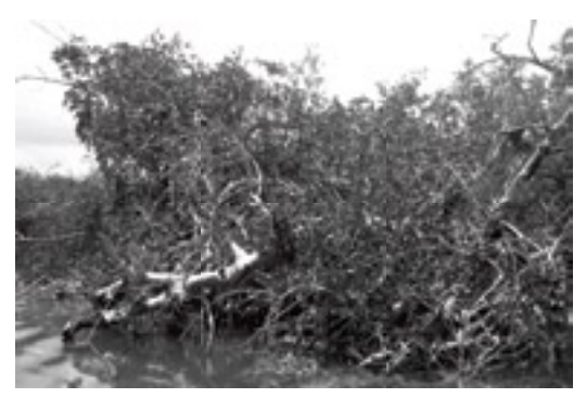
Mangroves, Rìa Lagartos Biosphere Reserve, Mexico