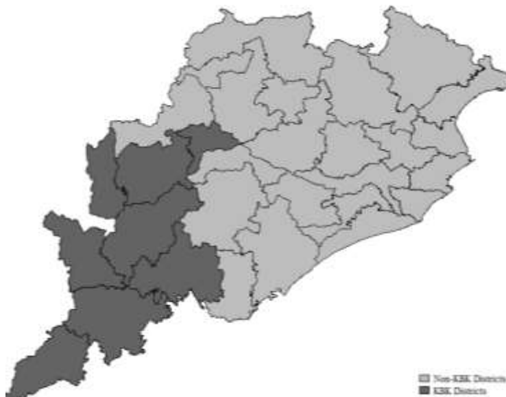
Figure 1: Odisha and KBK districts

KBK region 5 . In spite of that, districts in the KBK region continue to figure amongst the poorest districts in the country as identified by the Planning Commission (Kujur, 2006). Programs to promote food security were initiated which aimed at providing food throughout the year for the old and those living below the poverty line. Cooked meals made from the locally procured nutritious vegetables were to be provided to the beneficiaries through the Anganwadi Centres (World Food Program & Institute of Human Development, 2008). It was expected to help increase intake of the required minerals and vitamins in addition to the calories. National Human Rights Commission has found strong evidence of malnutrition to persist in the KBK region despite the implementation of these welfare schemes. Failure of Public Distribution System (PDS) has been cited as a major reason for high level of undernutrition in this region.