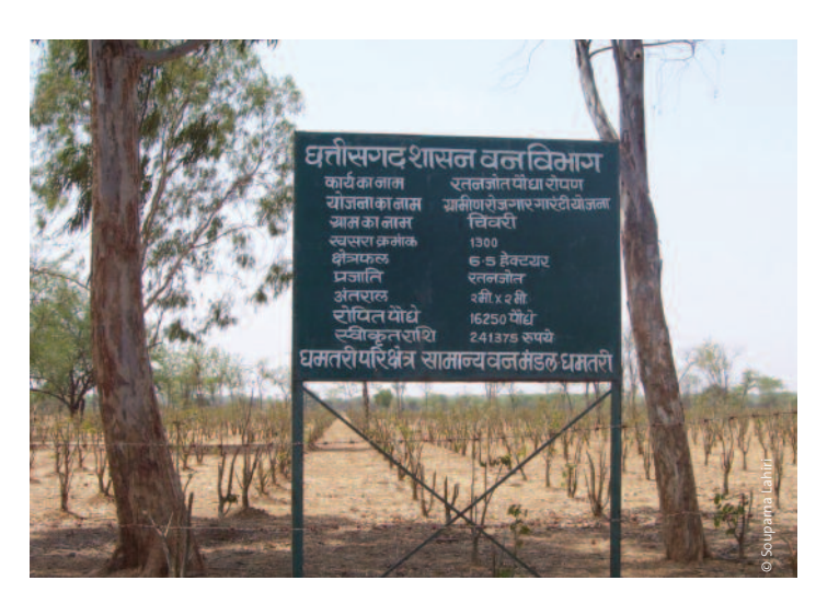
Jatropha plantation on 6.5 ha of village common land at Chiunri, Dhamtari district, handed over to D1 BP Fuel Crops, planted with the development fund earmarked for National Rural Employment Guarantee Scheme

Indian company IKF Technologies has a memorandum of understanding with a Madhya Pradesh state company to develop a biodiesel refinery with 5,000 ha of jatropha plantations. It also has a number of joint venture agreements, and claims contract farming arrangements covering 10,000 ha<sup>28</sup>.