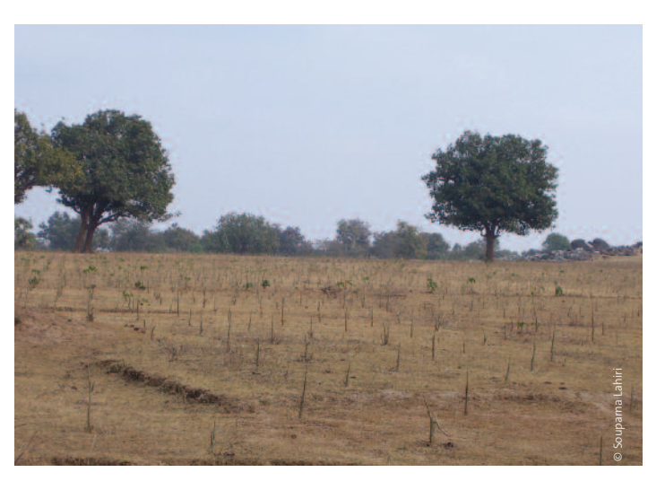
Jatropha plantation on previous grazing land, Chhattisgarh.

19 www.cbdacg.com, website of the Chhattisgarh Biofuel Development Authority 20 Chhattisgarh plants 100 million jatropha saplings in 3 yrs, Business Standard, February 13, 2009, Kolkata