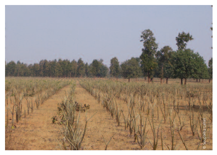
Jatropha plantation, Barbesan village, Chhattisgarh.

Other states, which had not been targeted in the Planning Commission's proposal also have encouraged jatropha plantations.