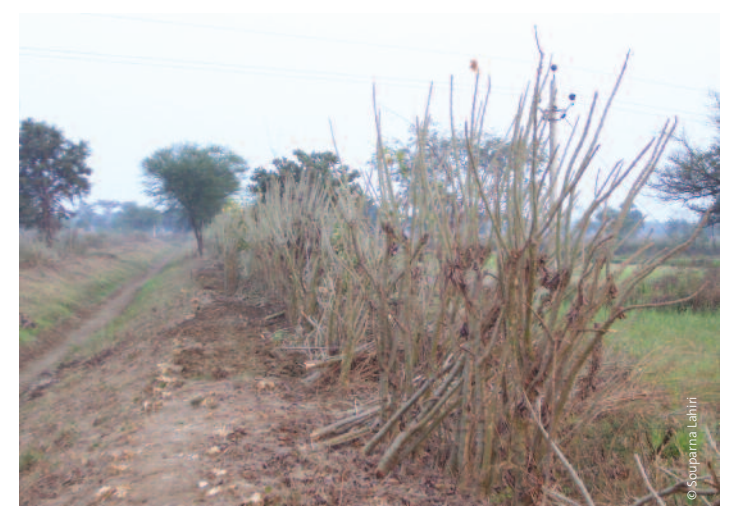
Jatropha used as a tradional hedge fencing, Medha village.

The Commission claimed that jatropha would generate "massive income and employment for the poor," providing employment for 127.6 million man-days in the plantations and 36.8 million person days for seed collection by 2007. Income from the sales of seed would generate Rs 750 million, enabling 1.9 million poor families to escape from poverty.