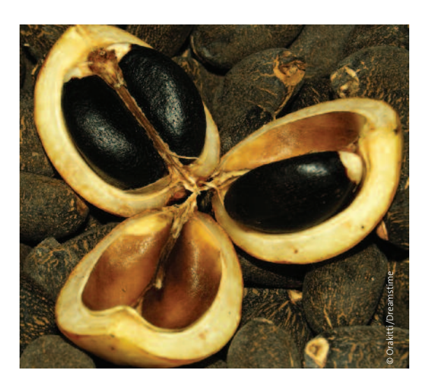
Jatropha fruit usually contains three seeds. The oil is then converted to biofuel.

Evidence suggests that jatropha grown in its present form is unlikely to deliver the benefits its supporters have promised. Grown alongside other crops, with refining facilities in place, jatropha may deliver local benefits, but to remain sustainable, such developments would be small-scale in nature and in the control of local people. In reality, the most vulnerable communities are losing access to their land to the rapid spread of jatropha. Instead of being the saviour, it is becoming a threat to the rural people it was supposed to benefit.