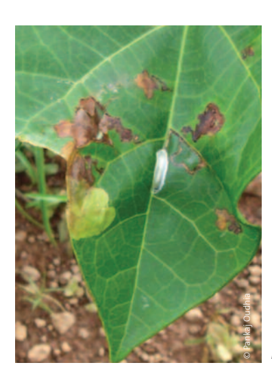
Pest infected jatropha in Sunderkhera village

The ODI study suggests that given the current market prices for biodiesel, jatropha is unlikely to provide the mainstay of people's livelihoods in India, suggesting that it is not really a viable source of employment. The study adds that jatropha could potentially provide a supplementary source of income for farmers if used for hedging, boosting income.