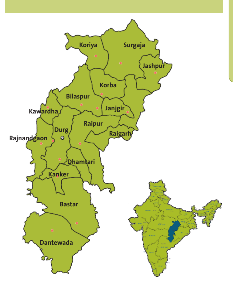
figure 1. State of Chhattisgarh

The state of Chhattisgarh has embraced jatropha with plans for one million hectares state-wide by 2012. In 2006, the former Indian President APJ Abdul Kalam Azad declared on a visit that the state was at the forefront of biodiesel production from jatropha and the state government responded by welcoming him to the "land of jatropha".