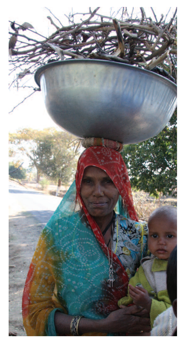
Jatropha used as a tradional hedge fencing, Medha village.

Under the Indian Constitution, it is the duty of the state to "protect and improve the environment and to safeguard the forests and wildlife of the country"11.