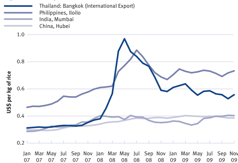
Figure 2: Rice price variation in Asia