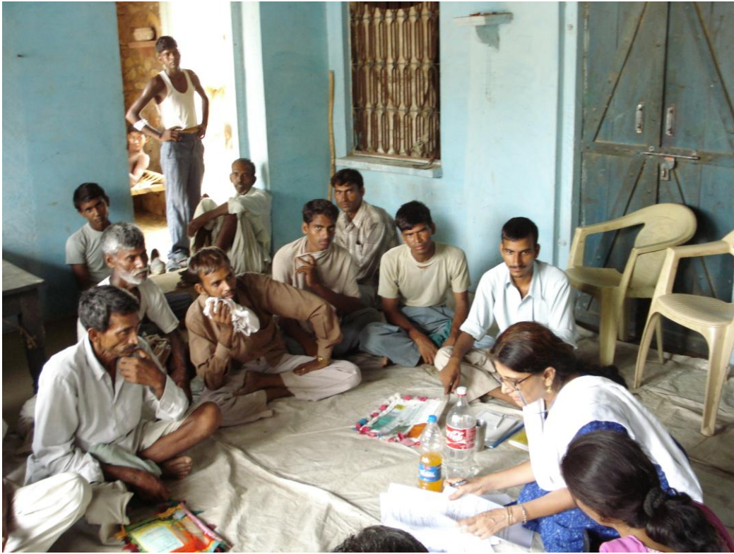
Photo 2.1: Focus Group Discussion with the Community at Shri Nagar village