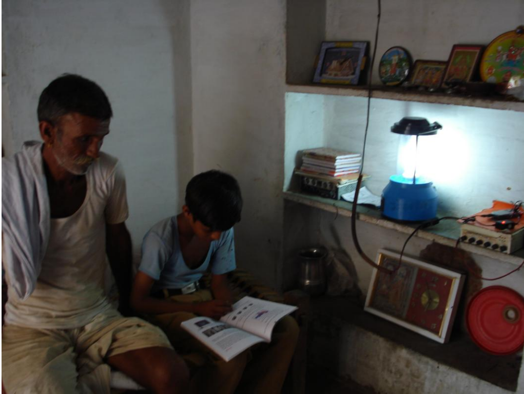
Photo 5.3: Gopalji's son studying with Solar lantern in Doi ki Dhani