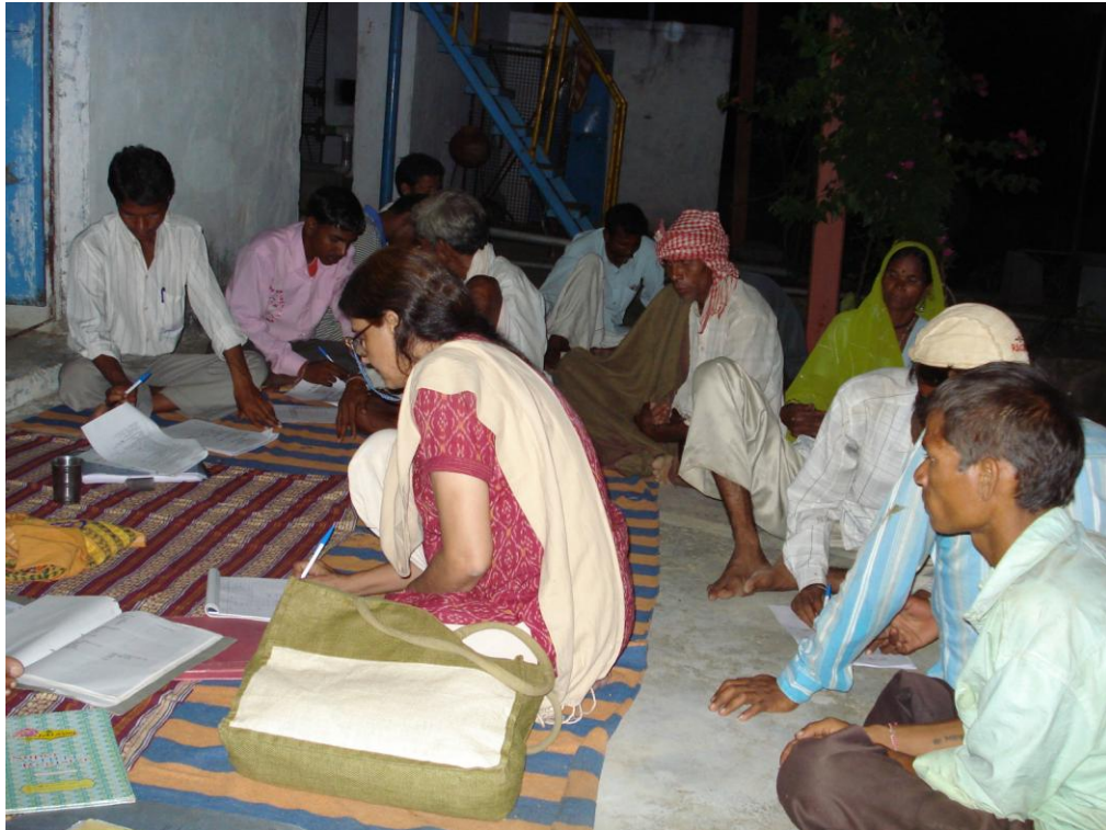
Photo 3.3: Filling questionnaires outside the Gasifier Shed at Sanwara