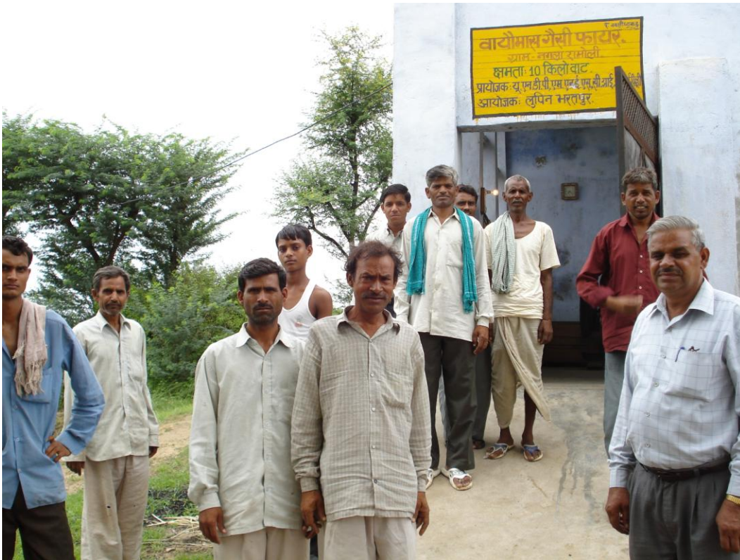
Photo 2.14: Gasifier Shed with fully functional Gasifier at Nagla Ramoli