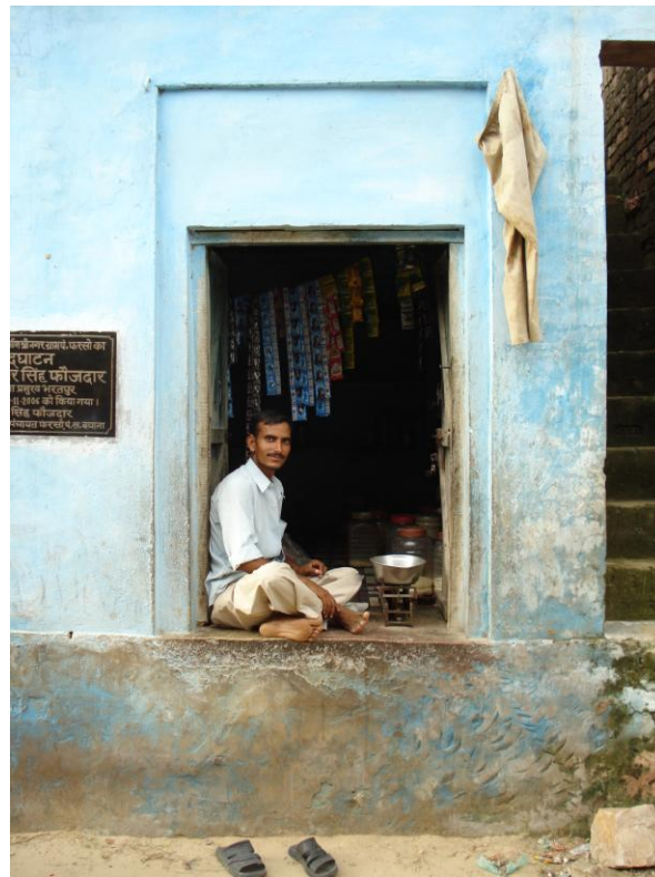
Photo 2.10: Facilitating the generation of livelihoods through a Kirana shop in Shri Nagar