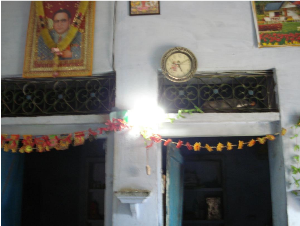
Photo 2.9: Solar home lighting system fixed in one of the houses in Shri Nagar