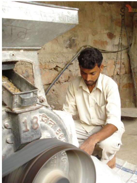
Photo 2.16: Atta Chakki converting Wheat into Flour at Nagla Ramoli