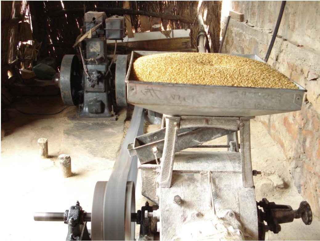
Photo 2.15: Atta Chakki using motive power from the Gasifier, Nagla Ramoli