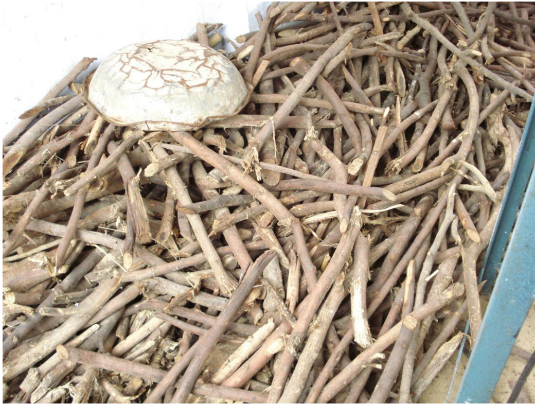
Photo 2.7: Biomass collected by village community for Gasifier, Shri Nagar