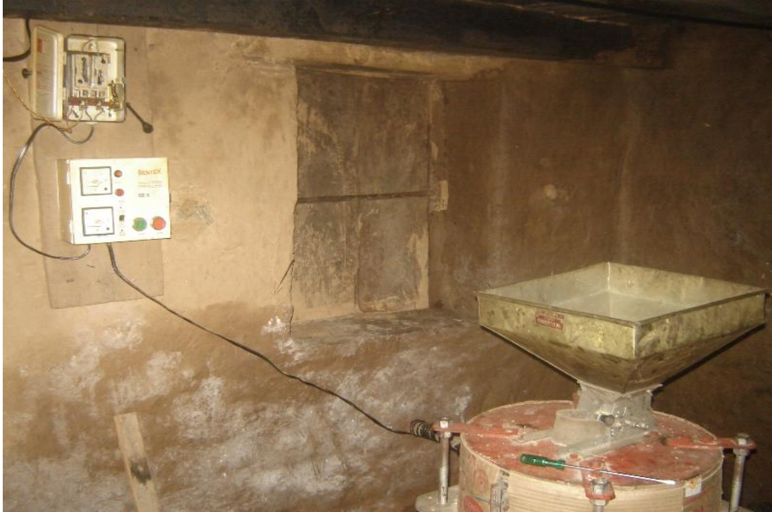
Photo 6.9: Atta Chakki in Topania based on Hydropower from Karmi III