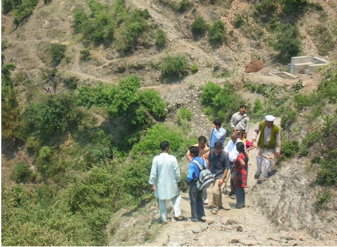
Photo 6.1: The IIPA Team with AHEC IIT Roorkee: On way to Dobar, Miri and Topania