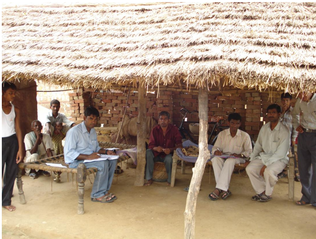
Photo 2.17: Filling household questionnaires at Nagla Ramoli village