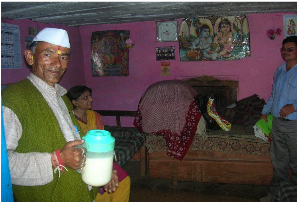
Photo 6.4: In Dobar Gram Panchayat just a few minutes before Miri – the best buttermilk ever