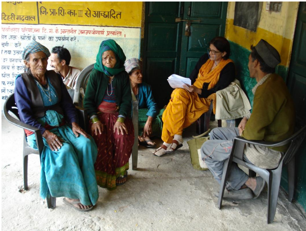
Photo 7.6: Demand for Income Generating Activities by the Community at Agunda