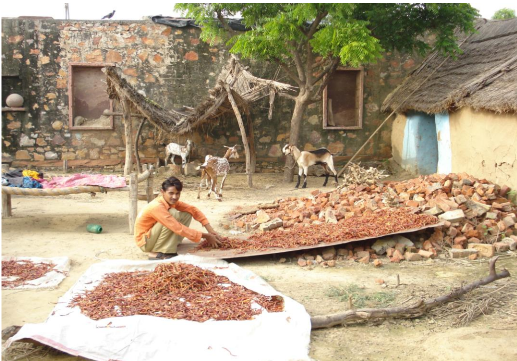
Photo 2.4: Dried Chillies to be processed through the Grinding Machine based on motive power from the Gasifier at Shri Nagar village