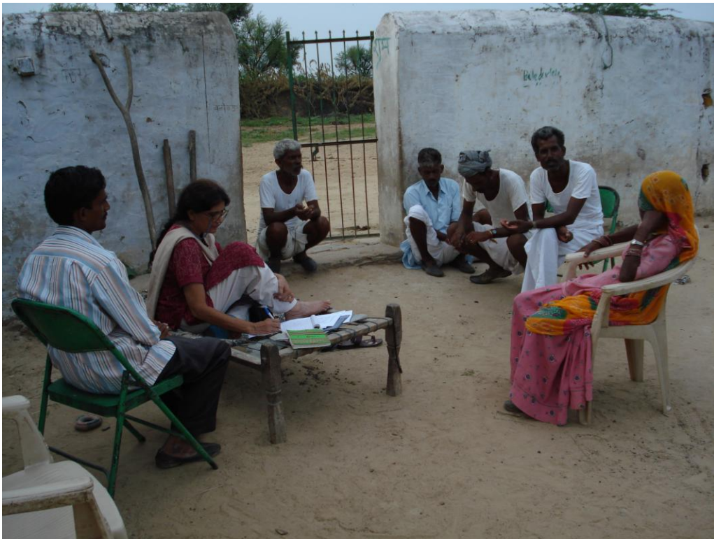
Photo 4.1: Discussion with the village community at Balaji Ki Dhani