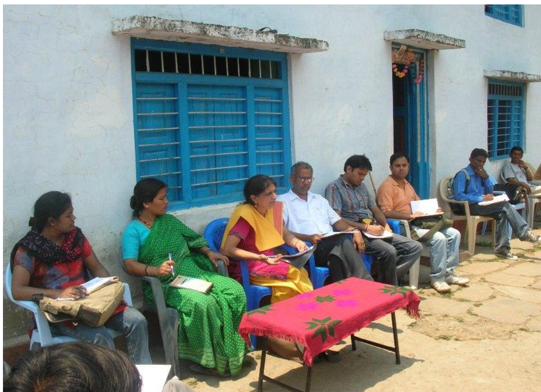
Photo 6.5: Focus Group Discussion with the members of Dobar Gram Panchayat at Miri