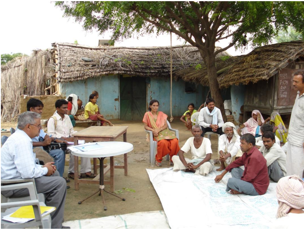
Photo 2.13: Focus Group Discussion with the village community at Nagla Ramoli