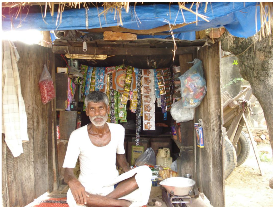
Photo 2.11: A Kirana shop in Shri Nagar village supported for income generation