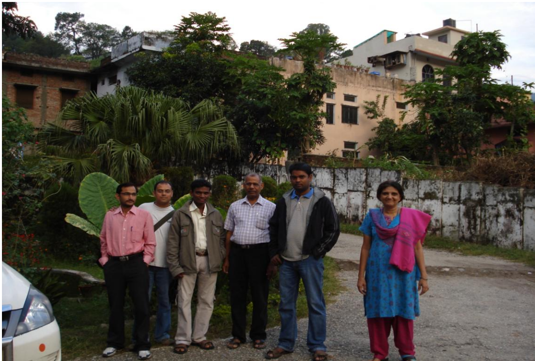
Photo 6.10: Leaving Bageshwar after completing the Impact Assessment