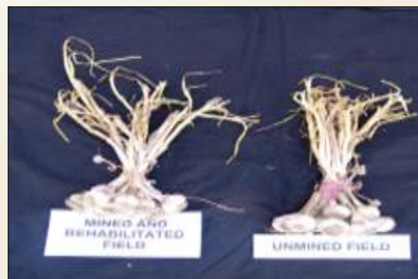
Plate 15. : Garlic and other tuber crops grow well in reclaimed soils

Yield data (Table 11) for onion, garlic and other vegetables were collected from sand mines at villages Jaurasi (Panipat) and Kunjpura (Karnal). Onion and garlic reported a yield loss of 32 and 40 percent in the first year of rehabilitation. Nevertheless, the loss narrowed down to 14 and 13 percent in the 3 rd year and surpassed by 14 and 13 percent than the original soil in the 7 th year. Several other vegetables like brinjal, radish and