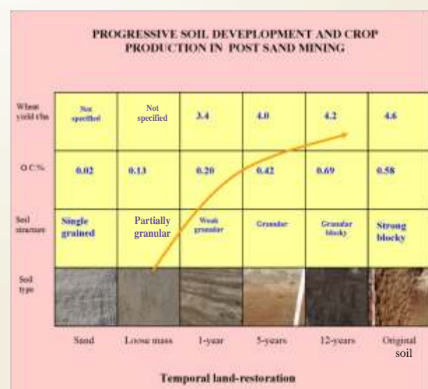
Fig. 2 : Graphical representation of soil development and crop production during successive years of reclamation of sand mines

development had gradually graded from weak granular in 1 st year to granular blocky in the 12 th years. Granular blocky structures denote aggregation of granules in the shape of small blocks leading to a stable soil profile. Similarly, organic carbon had increased by more than 400 percent in 12 th year and had even surpassed the un-mined soil by 16 percent. Clay content from 24 percent in the original soil decreased to 8.1 percent in the 1 st year and very slowly increased to