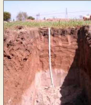
Plate 8 : Profile of an original soil at Village Nagla Mirgain. See moderate degree of soil development and sharp boundary of sand layer at 1.50m depth

topsoil. Careful mixing after breaking such clods is desirable for affecting improvements in soil texture and structure. The soils represented by rehabilitation for 5 and 12 years in the fields of Sh.