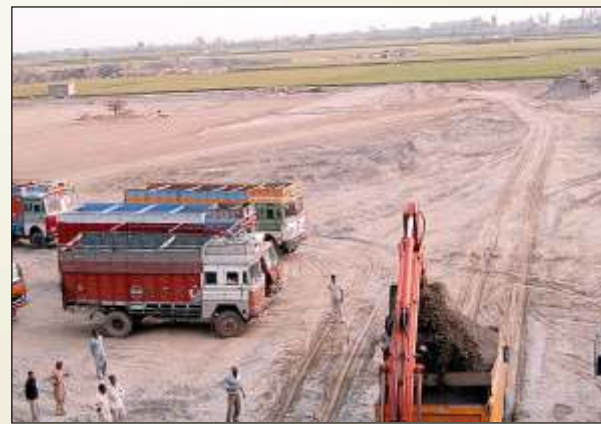
Plate 1 : Booming construction and infrastructure sectors have generated tremendous demand for sand in India.