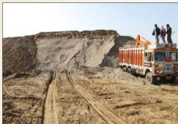
Plate 6 : Process of sand mining : thick column of sand (light grey) is removed. Overlying top soil cover (dark grey) is pushed down the slope to evenly spread over the sand pit

It is important to understand as how sand mining is done so that one can understand the reasons for the changes in soil properties etc (Plate 6&7). First of all, the soil mass is scraped from upper 2 to 3 meters, which contains mostly clay, silt and sand and is purposely saved and stacked aside in heaps,