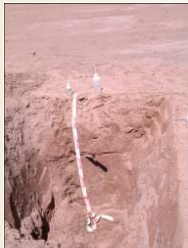
Plate 9 : 0-1 year ; loose soil mass and no horizon formation indicate no soil development

Plates 9-11 show progression of soil development during reclamation of sand mine