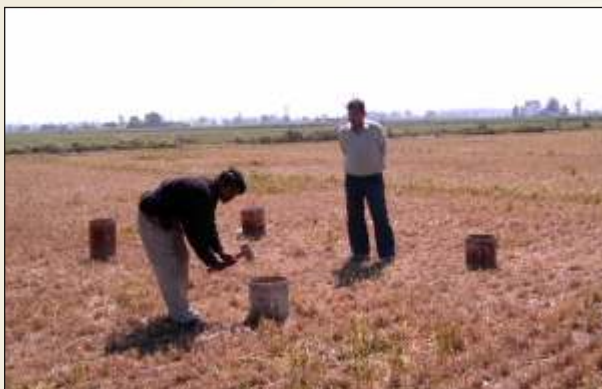
Plate 12 : Measurement of soil infiltration rate by double ring method

Soil infiltration rate indicate the movement of air and water in soil. Steady Infiltration Rate (IR) was measured in original un-mined and rehabilitated soils by double ring method (Plate 12). To overcome spatial variability in the field average of three rings were obtained. Steady IR of original soil was generally low and ranged from 1.7-4.0 cm/day (Table 5). This type of IR can be considered good for growing rice, a crop grown in standing water conditions. However, for other