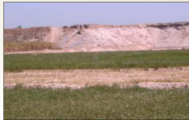
Plate 2 : Sand mining is increasingly practised in agricultural lands, Nagla Mirgain Sandmine in Karnal

granting contracts for the last three decades for extraction of buried sand from agricultural fields in district Karnal. Such contracts subsequently were extended to Panipat and Sonapat districts. Till the year 2006 only 1070 ha area was sand mined but recently sand extraction in these districts has increased significantly to meet the demand of booming construction activities.