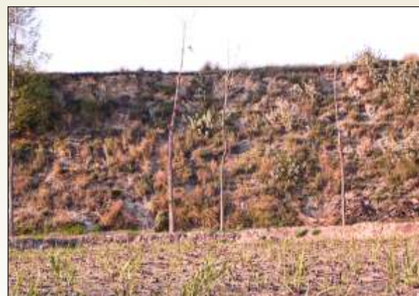
Plate 20 : Unattended side slope leads to severe land degradation while well managed side slopes can be strengthened and stabilised