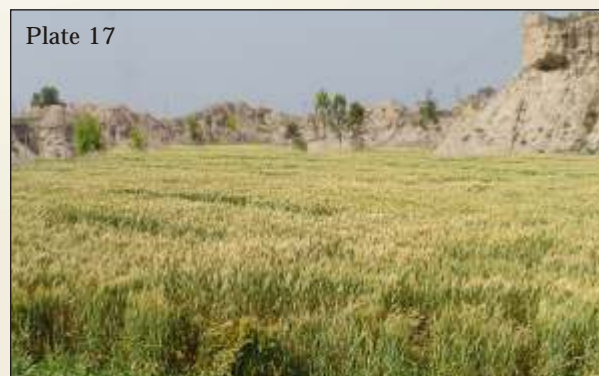
Plate 16 & 17. : Comparable crop growth in 3 rd year of reclamation & original un-mined soil