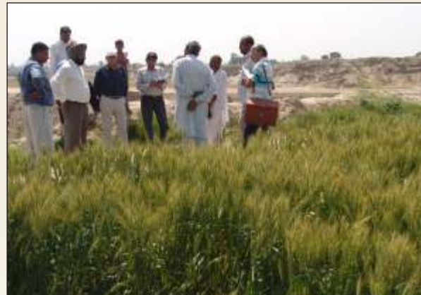
Plate 4 : Investigating team interacting with the farmers at Hari Singh Pura sand mine

of the Government of Haryana approached the Central Soil Salinity Research Institute, Karnal (CSSRI) to study the impact of sand mining on soil properties and crop yields so as to provide guidelines for framing sand mining policy in the state. A team of scientists from the CSSRI under a consultancy project studied the mined and adjacent un-mined sites (Plate 4) at several places in Karnal, Panipat and Sonapat districts to ascertain the impact of sand mining on soil properties and crop growth, which so far has not been studied in India.