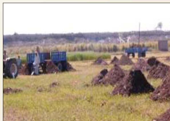
Plate 13. : Farmers usually apply heavy doses of organic manures during reclamation of sand mines

After stacked topsoil is spread and mixed with sand bed, the land is handed over to the farmer who commences rehabilitation. Each field is brought to a desirable level and bunded. It was noted that farmers take up land rehabilitation programme very enthusiastically. Because of small holdings they manage to procure and apply adequate doses of FYM (Plate-13). Some farmers were found to apply @ 20 to 30 t/ha of FYM or any other kind of manures including urban garbage and pressmud. Normally, they start with rice as first crop followed by wheat or sugarcane. Assessment of crop growth and their