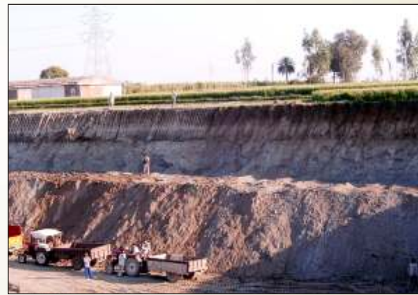
Plate 3 : Market driven forces are governing the land use of agricultural lands. Machharauli sand mine in Panipat

imposing a total ban on sand mining and protect the land for agriculture may not succeed. Guided by the easy money and vested interests the powerful sand mining lobby might resort to illegal and indiscriminate sand mining causing devastation and degradation of land resources. Keeping in mind interest of both the agriculture and construction industry, the best option would be to regulate sand mining under the provision of the law and prescribe concurrent reclamation of the mined land for return to the agricultural use. Thus, sand mining from agricultural fields could be considered provided ecologically sensitive areas and diverse habitats are protected and mined areas are immediately reclaimed to preserve the nature of property as an agricultural enterprise.