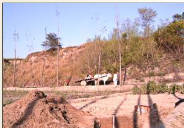
Plate 18 : Dilbergia sisso and Anjan grass thrive well in sandy soils

The rehabilitated soils, grow several crops like rice, wheat, sugarcane, sorghum fodder, vegetables, gram, mustard, berseem, methi, potato and tomato etc. These were also satisfactorily growing a variety of trees like poplar, eucalyptus, neem, guava, pome- granate and papaya etc. Even the natural vegetation grew very well on the slopes of the 5-7 years old mines. The dominant species, which colonize these soils, included grasses, aak, prosopis, bacain, neem, sheesham and castor etc. Anjan grass ( cenchrus ciliaris ) and sheesham tree ( dilbergia sisso ) were found best for vegetating and stabilizing side slopes of mines (Plate 18). A farmer, Sh. Gulab Singh of village Jaurasi (Panipat) has converted 4 ha sand mine into a well-developed farm. He has