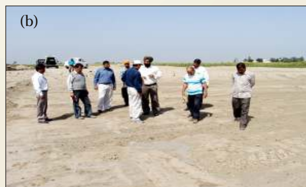
Plate 5 : Group of scientists studying (a) 10m high sand column and (b) freshly leveled sand pit at Nagla Mirgain sand mine