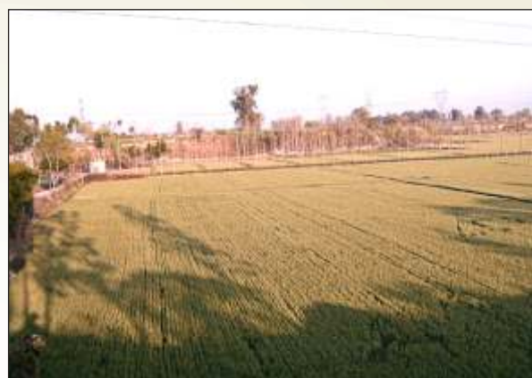
Plate 19 : A well reclaimed sand mine at Jaurasi in Panipat

constructed pucca water channels for conveyance of canal and run-off water, pucca field channels and pluggable nakas for each field and has made small sized fields for uniform application of irrigation. Such practices has enabled him to cut down on water losses through infiltration and also minimized soil erosion. Obviously, he obtains much more crop yields than his counterparts (Plate 19). Here nearly 10-meter