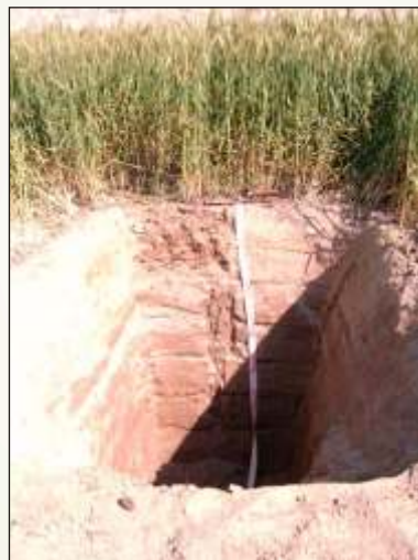
Plate 10 : 5 years ; slight differentiation of horizons and granular structure indicate very slight soil development