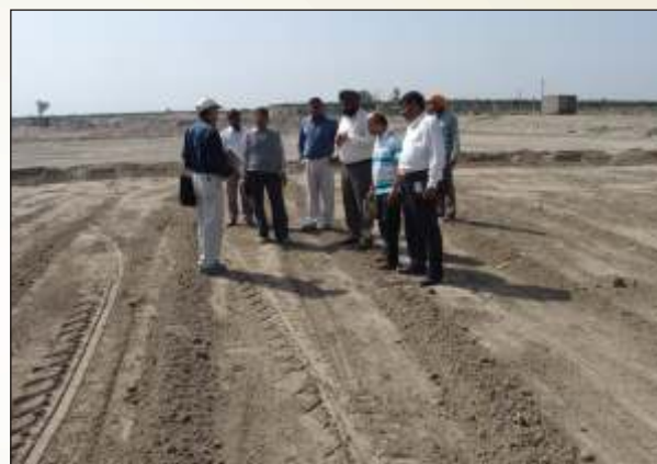
Plate 7 : After spreading and mixing top soil with sand, the field is compacted, leveled and banded to commence cultivation

for use later on as soil spread on sand debris. The exposed column of sand is removed by the contractor and sold in the market. About 15 years ago, manual extraction and higher water tables restricted the sand removal to 5 and 6 m but in recent times use of Earth Moving Machines (EMM) and receding water tables have facilitated sand extraction to a depth of 10-12 m. After sand is removed, the heaped soil mass is evenly spread over the sand bed for the farmer to begin land restoration by leveling, bunding and tending his land to start cultivation.