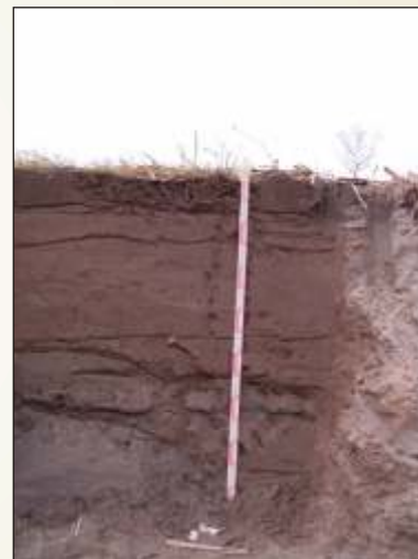
Plate 11 : 12 years ; darkening of soil colours and granular blocky structure indicate slight soil development

air-water balance to enhance soil productivity. Nevertheless, such lighter soil textures might pose difficulties in seedbed preparation during the initial years of cultivation. But soil compaction by heavy machinery, irrigation and root activities etc are likely to cause soil cohesion, which should favour soil development in the subsequent years. Common occurrence of clay-clods of 5 and 40 cm in the soil profile during rehabilitation stages indicate improper mixing of