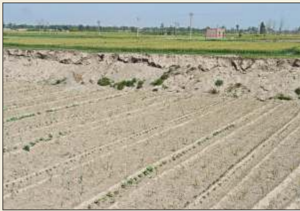
Plate 14. : Sequential reclamation of sand mines, see reclamation in 1st year (foreground) and for 5-years (background)

yields were estimated on the basis of visual observations and inquiries from the farmers. Some crop growth parameters such as number of tillers per unit area, height of plants and length of seed bearing ears were also recorded to correlate yield estimates. The yield data of different crops grown in sand mine areas under rehabilitation for 1, 5 and 12 years was collected (Plate 14). Yield data of corresponding crops from adjacent