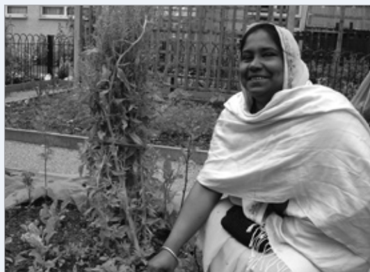
Just Cities trip to Middlesborough - 2007

This work demonstrates that given the right tools people can take action to improve their environment and fight for environmental justice.