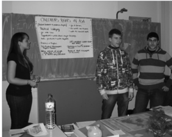
Above: Just Cities Berlin-Campaign workshop 2007

The Just Cities programme has been raising awareness amongst young people aged between 14 and 18 from London, Amsterdam, Paris and Berlin about environmental issues and the career opportunities. As a result, some of the young people have themselves set up a pan-European social enterprise to provide young people with opportunities to take part in environmental consultations. The enterprise will also provide much-needed jobs and work experience to young people from low-income households across Europe.